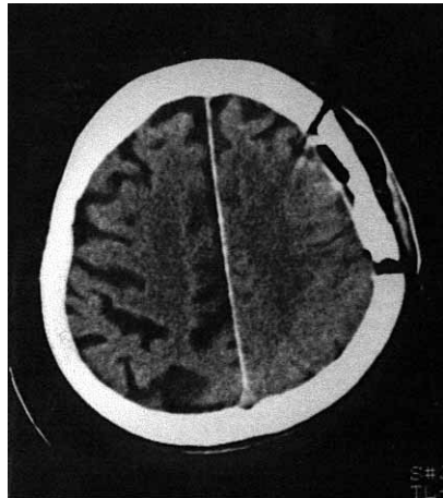
Fig. 2. Postoperative brain CT scan after cyst ablation and osteoplastic craniotomy

atic, they are therefore accidentally found on brain magnetic resonance (MR) or CT scans. Small asymptomatic cysts of the choroid plexus are a frequent incidental finding at necropsy 12,13 . They are usually located in the lateral ventricles but sometimes may be found also in the fourth ventricle. Their size usually does not extend beyond 1.5–2 cm in diameter which was also true in the re-