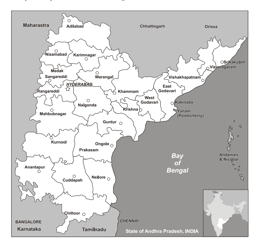
Map 2: Part of India from where the Telegus came

each generation in order to determine their attitudes towards Telegu and the other codes used.