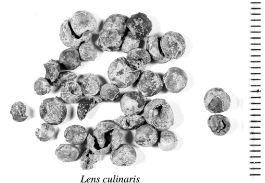
Fig. 4. Some of the most numerous non-carbonized plant remains found in Roman graves: Panicum miliaceum and Lens culinaris from Šćitarjevo and Vitis vinifera from Ilok.

limes. The fig was not only a favourite fruit, but, dried, was used as a sweetener. The olive is the most prominent and economically probably the most important classical crop in the Mediterranean. The olive and the fig will undoubtedly constitute evidence of Romanisation of the local population, and since they were a valued and important item of trade were often found as grave goods<sup>15–17</sup>.