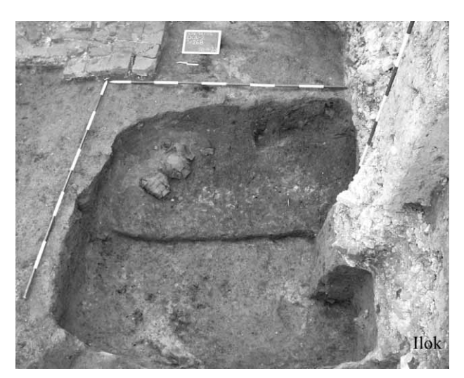
Fig. 2. Early Roman incineration grave of Ilok (Cuccium).

the La Tène culture of the Scordiscs. A large number of imported items were deposited in the grave, such as a dark-grey bowl with thin sides, a token made of dark--blue glass paste, a glass vessel (funnel), a ceramic lamp, a bronze earring, the handle to a bronze vessel and Claudian era coins. These items are of northern Italic origin and they date the grave to the middle of the 1st century AD. It belonged to a distinguished person of autochthonous Celtic-Pannonian origin<sup>6</sup>. During examinations around and in both pots, numerous plant finds (seeds and fruits) were discovered, so that the content of the vessels and the materials found around them were preserved for archaeobotanical analysis. It is not surprising that two situla-shaped vessels contained plant remains, since as kitchen pots they were used to prepare food, both during the Scordisc La Tène culture from the 3<sup>rd</sup> to 1st centuries BC and later in the 1st and early 2nd centuries AD, when they were replaced with kitchen vessels typical of Roman provincial culture.