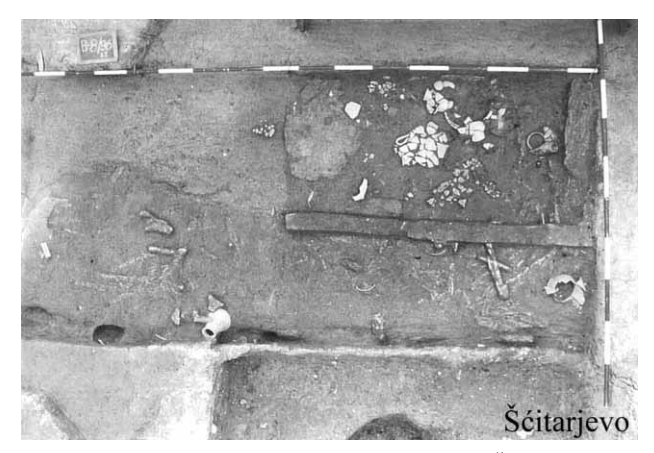
Fig. 3. Early Roman incineration grave of Šćitarjevo (Andautonia).

Šćitarjevo (Andautonia) was, during the Roman era, located in the territory of today's village of Scitarjevo, approximately ten kilometers south-east of Zagreb (Figure 1). The town was situated on the plain of the Sava River basin. This location that had exceptional transit importance, as the Roman road Poetovio-Siscia crossed the Sava River here. Since the Sava River was used for transport, Andautonia was certainly a major river port on the Sava. Previous archaeological research has confirmed that life in this town continued from the 1st to the 4th centuries AD. The core of the settlement and the earliest urban zone was situated on the elevated Gradišće site, where public and residential structures were discovered. as well as parts of town streets and drainage canals that reflect the highly-urbanised way of life of its residents. In the first and early second centuries, the town did not extend outside of the boundaries of Gradišće, and its dimensions were approximately 450 m (north-south) by 150 m (east-west). This is indicated by necropolises located to the south and east of Gradišće, with access roads