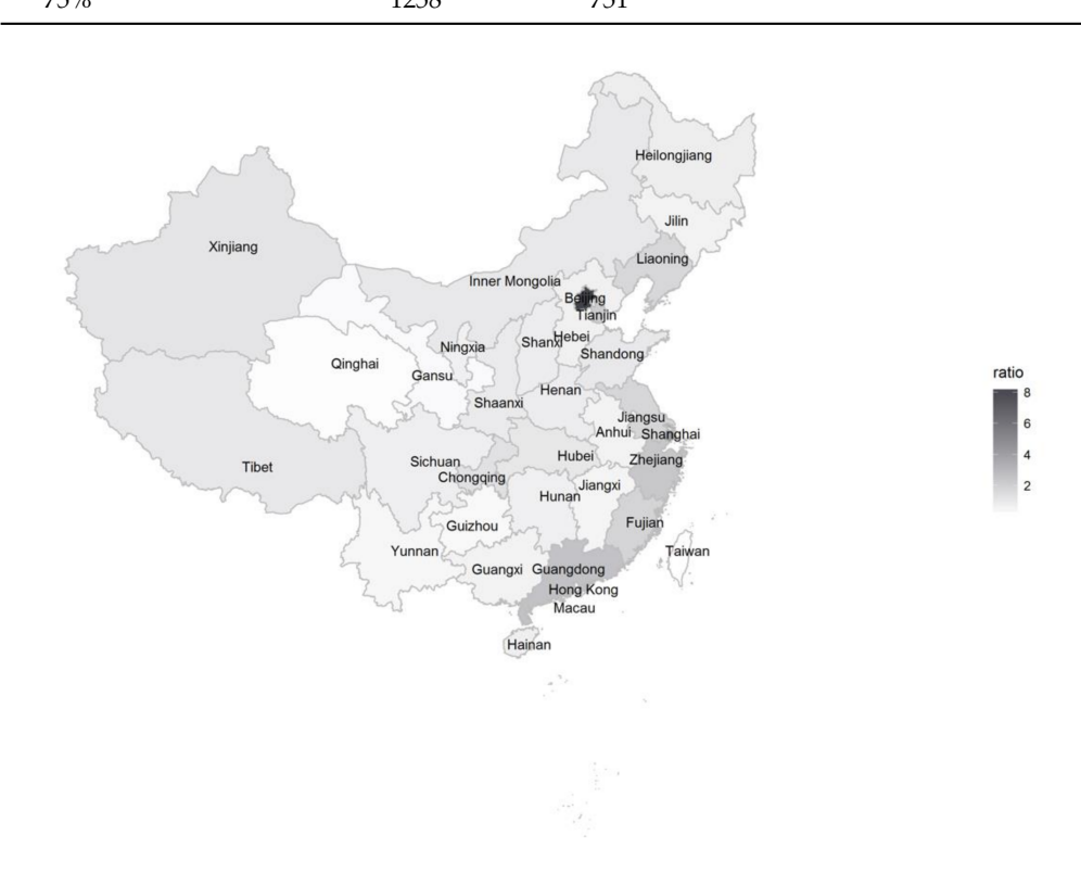
\textbf{Figure 2.} \ \ \textbf{Geographic distribution of users with depression}.