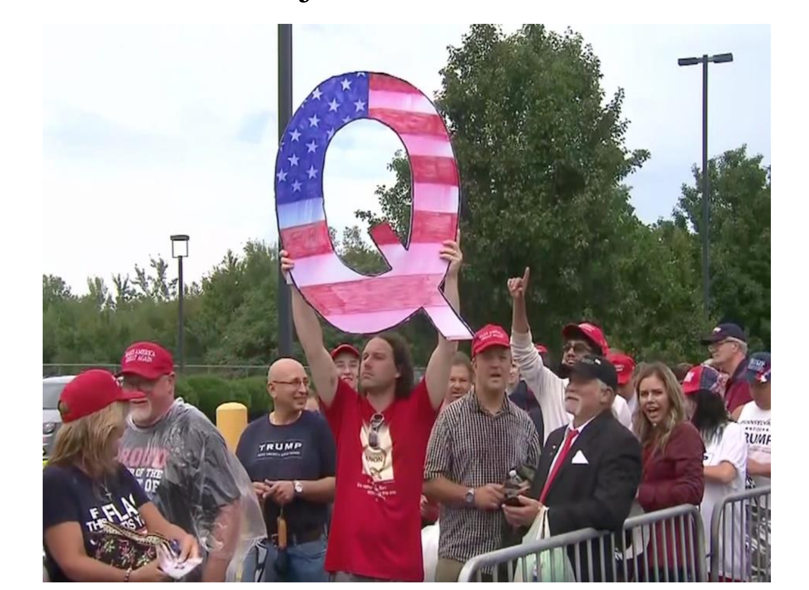
Qanon believers in AZ, 2020

From Covid-19 to Qanon to a global warming hoax, we live in a world drowning in misinformation spread on the internet. Qanonymous, a purposed government "leaker" is an alleged high-level government informant, according to Qanon followers, who posted cryptic messages about a satanic government on the nowdefunct forum website, 8chan. This project will examine the possible relationship between a belief in various conspiracy theories associated with Qanon and how the Coronavirus affected rates of belief, utilizing the Chapman Survey of American Fears, a national study using a representative sample of U.S. adults. I expect to find that partisanship will play a large role in predicting rates of belief in Qanon. I believe I will find this relationship to be dependent on the nature of the conspiracy theories themselves. Conspiracy theories that stress governmental lies and secret groups of great control likely will likely have gained support in light of the Coronavirus outbreak and subsequent shutdowns. In this project, Questions on partisanship, Qanon and two COVID19 related conspiracy theories will be used to test for the aforementioned ideas. I expect believers in COVID19 related conspiracy theories to have a higher belief in the notion the government is hiding information about Qanon. With this project, I hope to identify the links between conspiracy theory belief, Qanon, and the Covid-19 virus in order to better understand public attitudes on the subject.