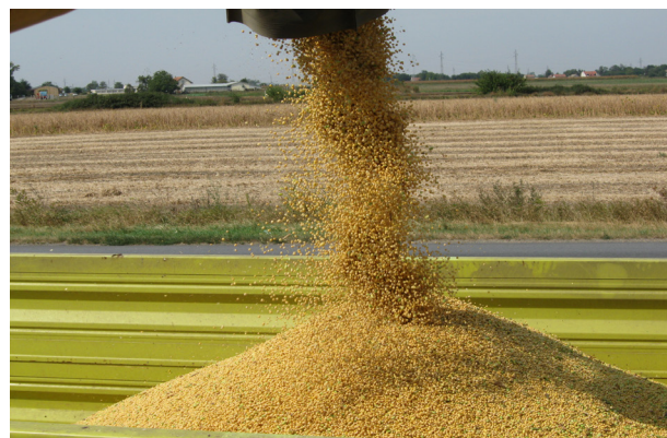
Pouring soybean grain onto a tractor trailer.