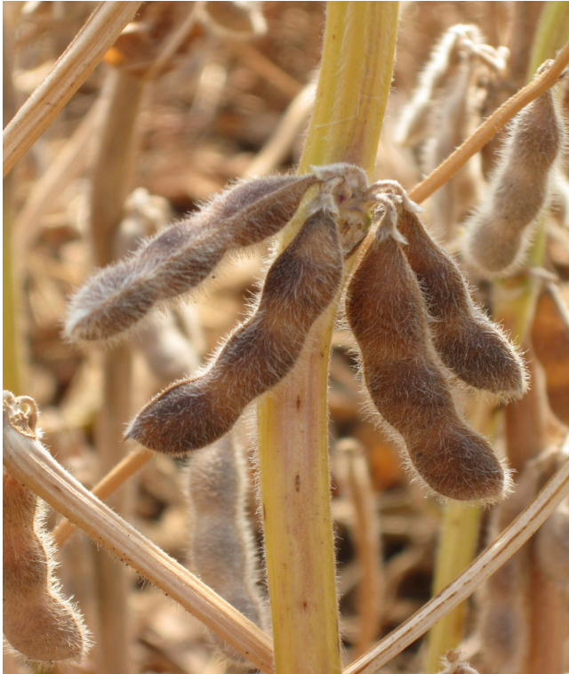
Mature pods.

sight, it is also possible to start harvest up to 20% moisture, but then drying is required which involves additional costs. Losses increase and seed quality is reduced with delayed harvest.