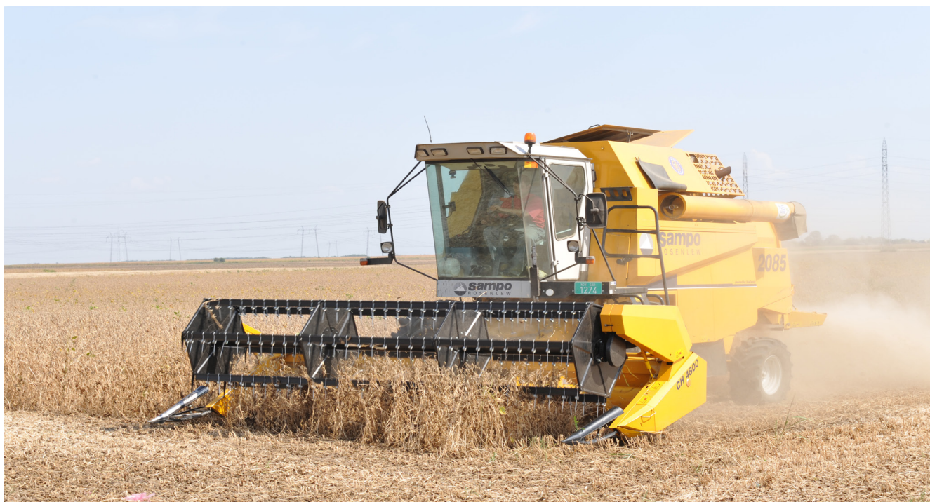
Combine harvester.

depends on temperature and precipitation. The moisture content in the seeds can differ within a day by 5%. If the seeds are too damp in the morning, they can dry during the day. The moist phase persists longer as the nights become longer and colder. Wind accelerates drying. If after mid-October the seed moisture content is higher and no better weather in