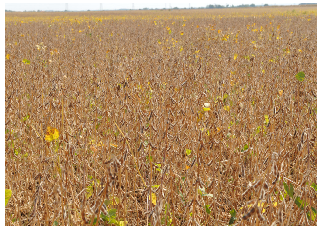
Soybean ready for harvest.

The ideal grain moisture content is about 13%. For seed production it is about 15% because seeds at this moisture content are less vulnerable to mechanical damage. Waiting until the crop has dried down to about 12% reduces the cost of drying after harvest. The seed moisture content must be below 15% for short term storage and about 12% for long term storage.