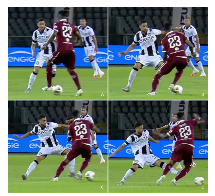
Figure 2 (A and B) Defender: reading opponents body language and anticipating. Attacker: makes a deceiving action. (C and D) Defender: rapid change of movement from right to left, reacting to attackers deceiving action. (D) Defender ruptures his right ACL.

Selective attention is the athlete's ability to focus on a relevant situation on the field and suppressing attention to other stimuli that are not relevant.<sup>10</sup> Lacking the capability to redirect or sustain attention from one stimulus to the next may result in a loss of spatial awareness and disrupt motor control.<sup>15</sup> Video analysis of actual ACL injuries in high school, college and professional basketball indicated that the injured player's attention was commonly focused at the basket rim, followed by attention directed at the opponent or a focus on the ball.<sup>16</sup> Such divided attention means less attention for the athlete's own movements and may have contributed to the ACL injury mechanism, as less time is available to correct or change an already initiated movement (figure 2).