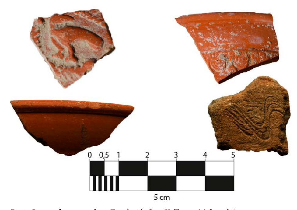
Fig. 8. Pottery fragments from Tocolosida fort (K. Trusz, M.Czapski)