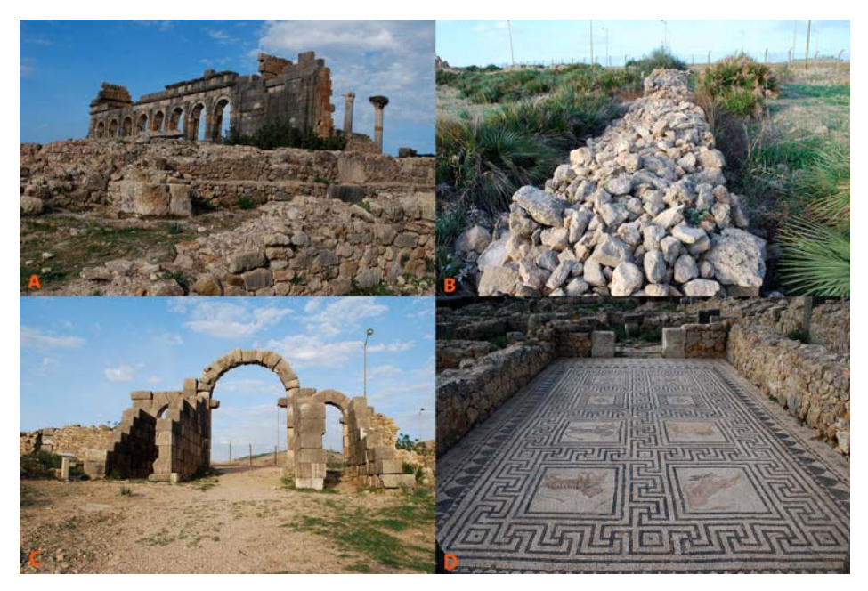
Fig. 3. Volubilis