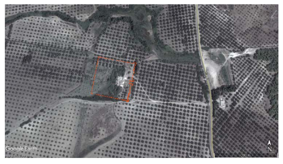
Fig. 7. Ain Schkour fort (M. Czapski, based on Euzennat, 1989)