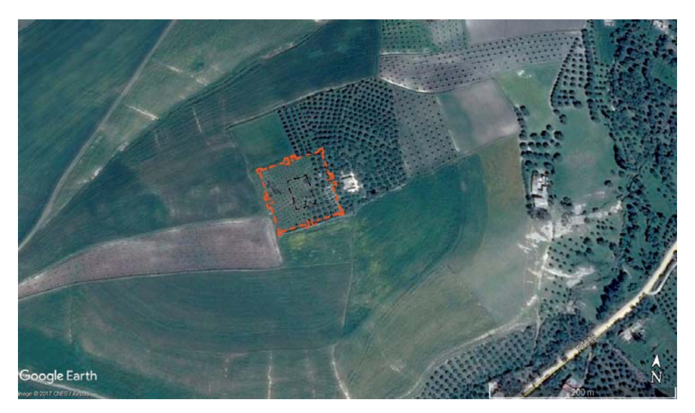
Fig. 5. Sidi Moussa fort (M. Czapski, based on Euzennat, 1989)