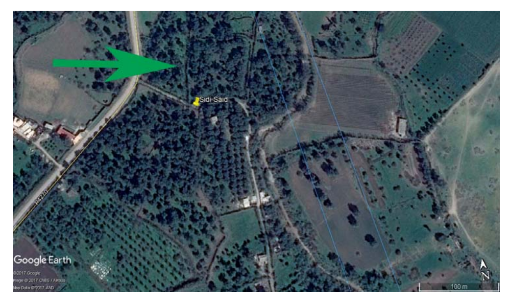
Fig. 6. Probable location of Sidi Said fort (M. Czapski, based on Euzennat, 1989)