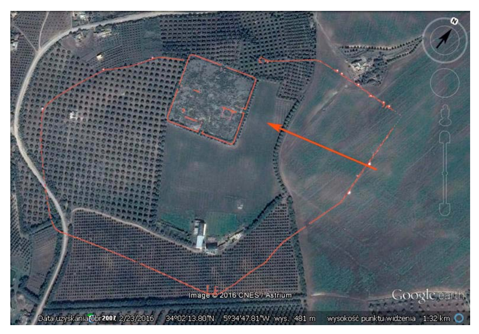
Fig. 4. Tocolosida fort (M. Czapski, based on Euzennat, 1989)