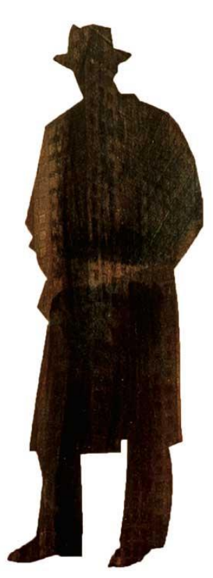
ILLUSTRATION: EKUA HOLMES

I'd soon learn that these three groups were inextricably linked in the minds of many Southerners who opposed integration. That night, however, all I could say was no. Finally, the agents turned to leave. "I wouldn't stay in Montgomery very long," one of them warned.