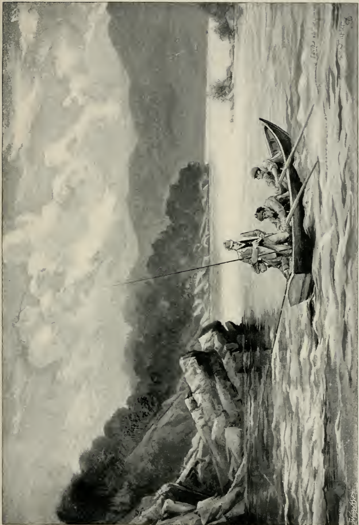
'HARLING' ON THE TAY