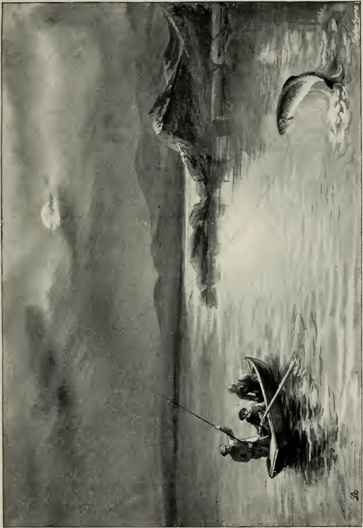
A NIGHT WITH A SALMON