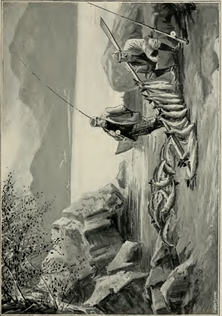
BIG DAY ON THE GRIMERSTA