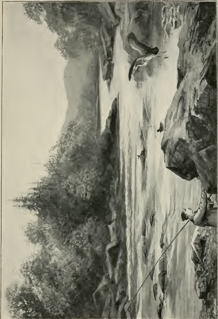
A BLANK DAY