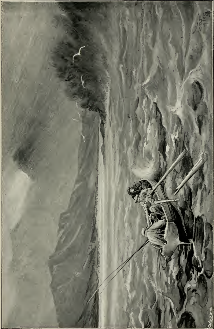
A GALE ON THE LOCH--THE CRAZY OAR SNAPPED