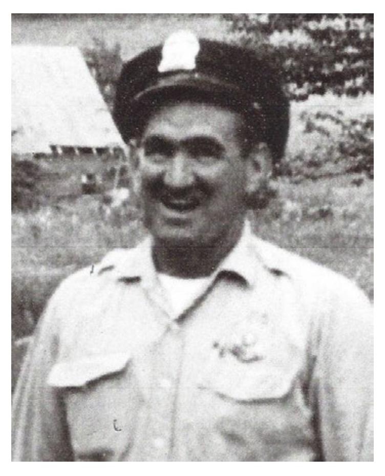
May 17, 1928 – February 12, 2019 "...the Springfield Police Chief for 25 years."