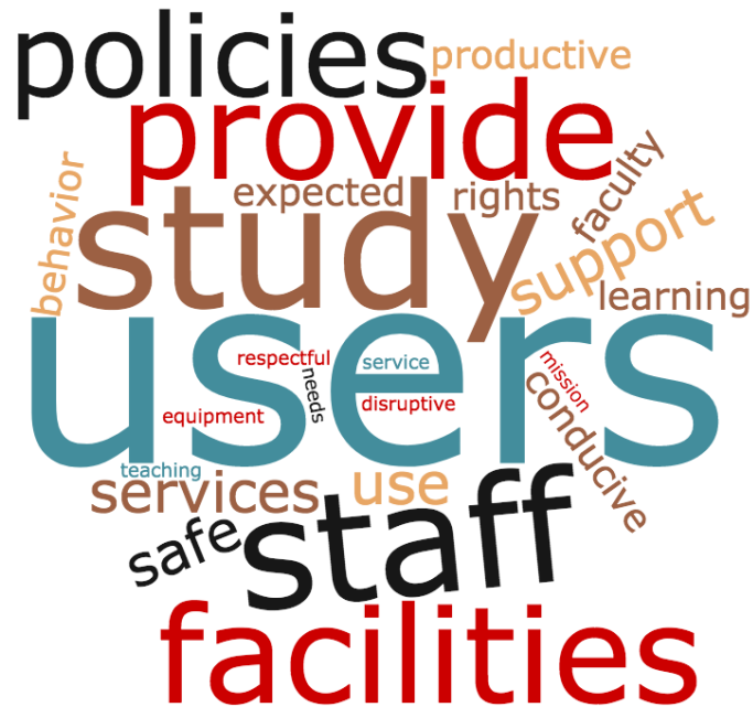
Figure 1: Common Preamble Words

Of the 31 codes of conduct reviewed, only four documents (13%) included explicit contact information and reporting instructions within the text. One document highlighted that the library provides accommodations for individuals with disabilities and provided contact information for requesting an accommodation. Another document invited people viewing the policy to submit feedback. Most did include information about what actions would be taken if a violation of the conduct code was reported (68%). Twelve documents (39%) stated the date when the document was last reviewed and updated and often included the dates of previous revisions in the documentation. One code had not been updated for 17 years, and another had been updated just this year. On average, the date of “last update” was six years ago.