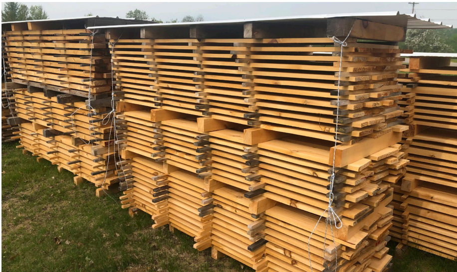
Figure 1. Pile covers in an air-dry yard help preserve the quality and value of the lumber by protecting the lumber from the elements.

Degrade or loss of value of lumber stored in air-dry yards typically range from $21 – $54 per thousand board foot (MBF) and can easily reach $150 per MBF in poorly operated air-dry yards (Wengert 2006). Use of pile covers on stickered lumber, such as the ones shown in Figure 1, help to protect the top courses of lumber from undesirable discoloring and staining associated with sunlight and precipitation (Rietz 1970). Lumber