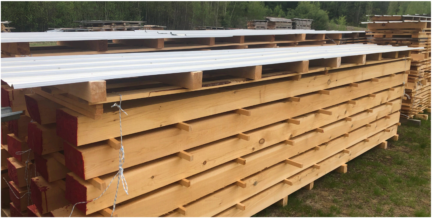
Figure 3. Example of tie-downs to secure pile covers in place and prevent movement.

the importance of using pile covers to preserve lumber quality and in turn lumber value.