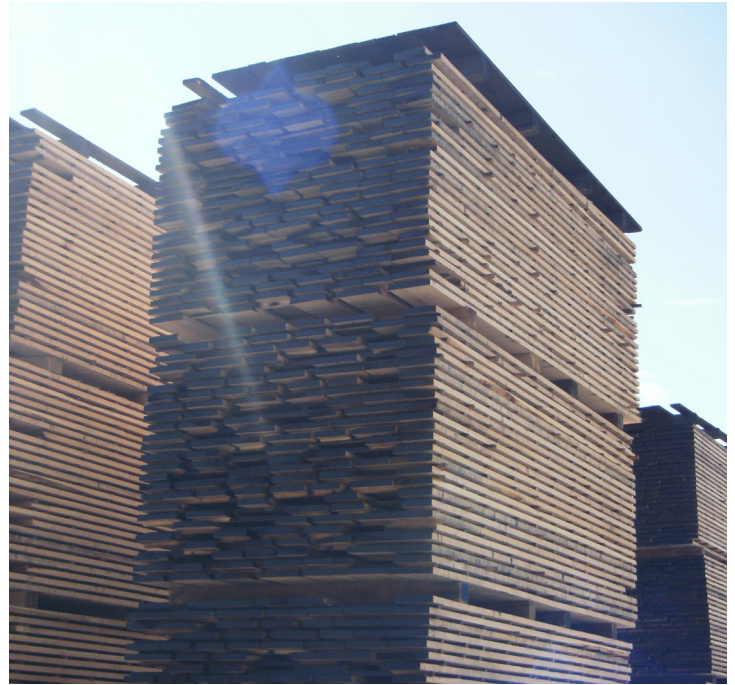
Figure 4. The boards missing from the pile covers in the above photograph can easily be replaced with low-grade lumber that is generated at the sawmill.

Lumber pile covers can be created by affixing uniform thickness and variable width boards to uniform sized small dimension cants. The purpose of consistent sizes and materials is to have uniform weight distribution across the stack. The pile covers illustrated in Figure 4, are neither providing uniform distribution of fully protecting the lumber piles from the elements due to missing boards. To fully realize the protection that the pile covers can provide, the boards will need to be replaced. When low-grade lumber is used, the cost to repair the damaged pile covers is minimal. Other material choices can be more costly and likely not as easy to repair. Doubling the layers and overlapping the seams can add additional protection to help prevent the pooling of water on the lumber surfaces being protected by the pile covers.