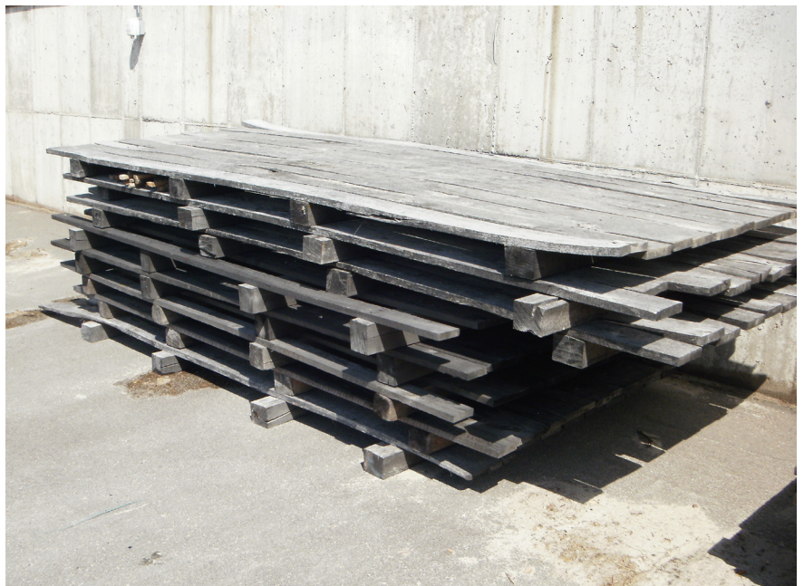
Figure 2. Pile covers fabricated with low-grade lumber fastened to small pallet cants.

Species such as ponderosa pine ( Pinus ponderosa ) and hard maple ( Acer saccharum ) are especially susceptible to darkening of the wood color which can substantially lower the market value of the lumber (Dawson-Andoh et al. 2004, Wagner et al. 2008). Ultraviolet light from the sun is a significant contributor to undesirable changes in lumber color (Kreber 1994). Pooling of water on lumber surfaces from rain or snowmelt can also be a factor in