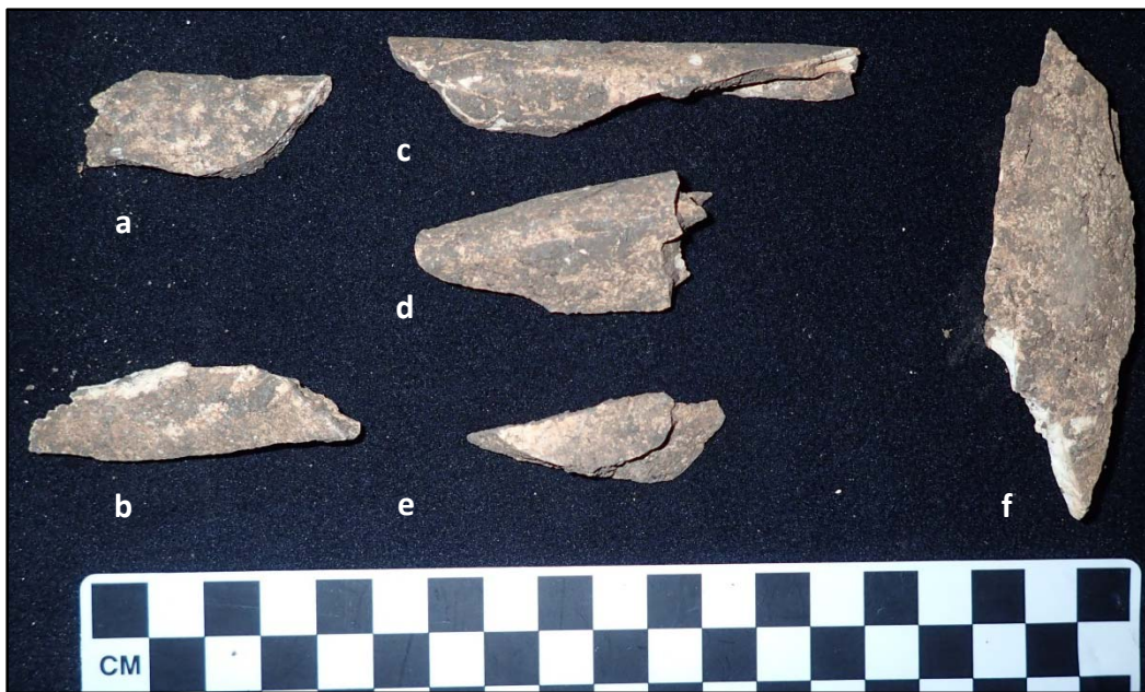
Figure 13: Large mammal long bone fragments from 41BX2131: a and b) EU 1, Level 3; c through e) EU 1, Level 4; f) EU 1, Level 6.