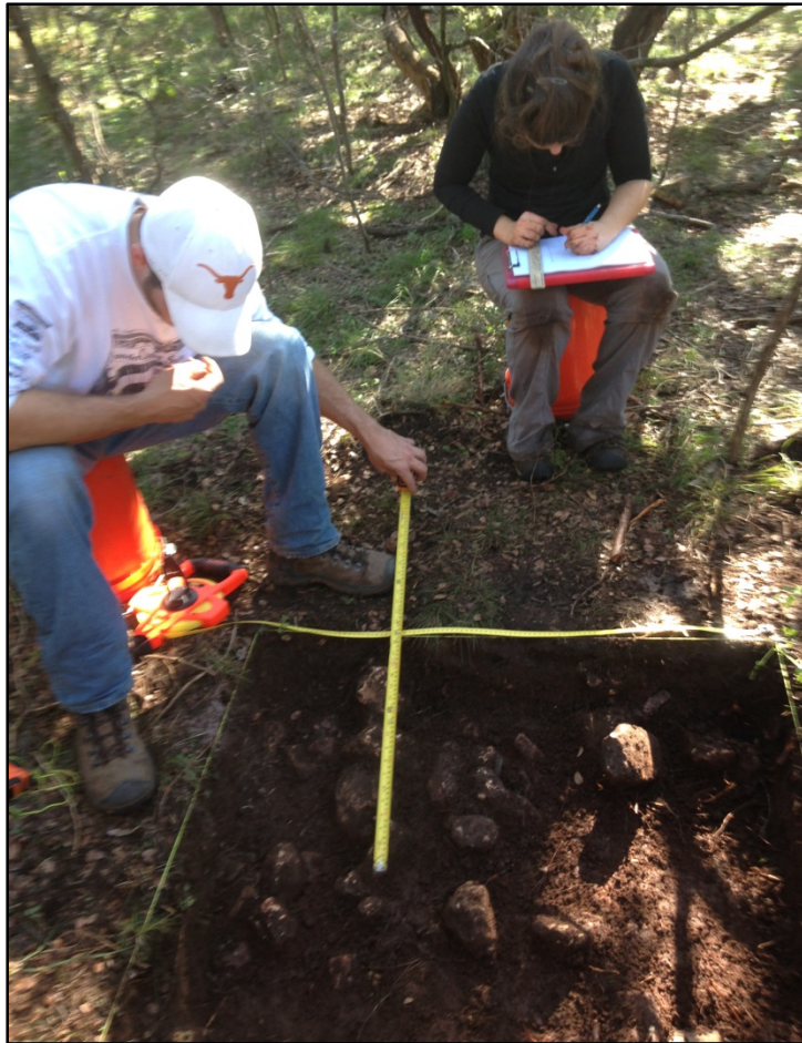
Figure 9: Plan view documentation at EU 2 during data recovery phase, facing south.