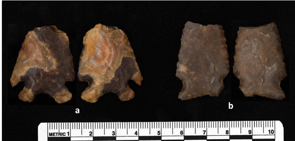
Figure 16: Both sides of Frio Projectile Points from Level 3 in EU 1 (a), and from the surface near EU 2 (b).

range of the Late Prehistoric period (1,200 B.P. to 250 B.P.), no pottery or Perdiz projectile points—which would be indicative of a Toyah-Phase occupation—were encountered at the site 41BX2131.