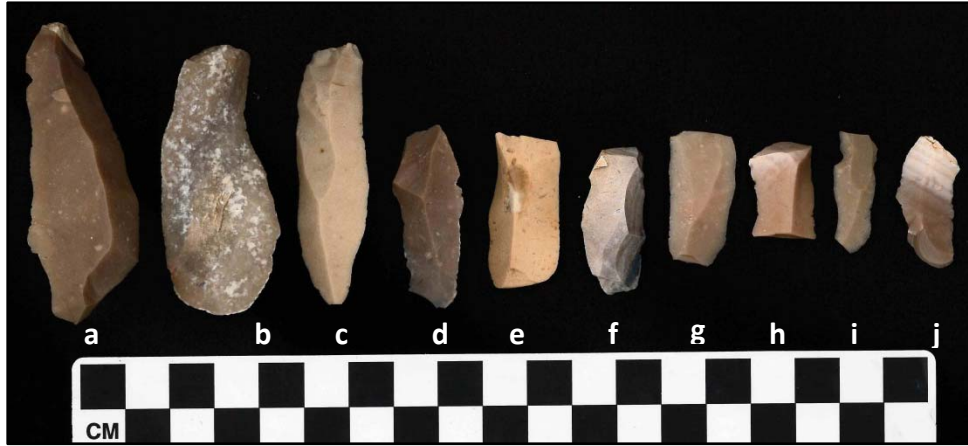
Figure 18: Blades from 41BX2131; all were recovered from EU 1, Level 3, except c), which was from EU 2, Level 2.