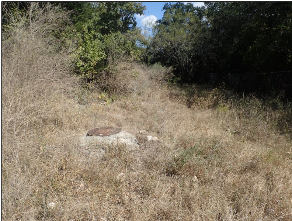
Figure 3: Sanitary sewer line along the project area's southeastern border, facing northeast.

As mentioned, the project area straddles an existing driveway that provides access to Jones Maltsberger Road. Additional prior disturbances noted during the investigations include two-track roads, sanitary sewer installation, several chain link fences, and a cleared field (Figure 3). The project area contains moderately dense to dense vegetation consisting of Live Oak, Ashe Juniper, Persimmon, and Hackberry trees with an undergrowth of Yaupon, scrub, and cacti. Located on the margins of the Blackland Prairies and the Interior Coastal Plains regions of central Texas (Wermund 1996), the site landscape is characterized by low stream terraces that emerge above Mud, Elm, and Elm Waterhole Creeks. The underlying geology is mapped as upper Cretaceous-era, undivided Buda Limestone and Del Rio Clay in the northern half and Holocene-era Fluvatile Terrace Deposits in the southern half (Bureau of Economic Geology [BEG] 1983). Buda Limestone consists of fine-grained, bioclastic, glauconitic, and pyritiferous limestone that is 60 to 100 feet thick (BEG 1983). Del Rio Clay is calcareous and gypsiferous, with pyrite and marine megafossils common, and from 60 to 120 feet thick (BEG 1983). Fluvatile Terrace Deposits are comprised of gravel, sand, silt, and clay on low terraces that are mostly above flood level along entrenched streams. Adjacent to the Edwards Plateau, these deposits are predominately gravel, limestone, dolomite, and chert (BEG 1983).