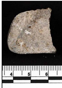
Figure 17: Ground stone fragment from EU 1, Level 4.

One piece of ground stone was encountered at the site 41BX2131 in EU 1, Level 4 (Figure 17; see Appendix E). The fragment from the unit was very small, but retained the characteristic smooth surface along one edge.