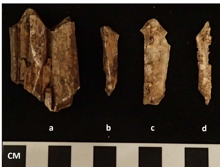
Figure 11: Bovidae cheek tooth fragments from 41BX2131: a and b) EU 1, Level 3; c and d) EU 1, Level 4. Specimens a, b, and c can be refit.

Ankle bone, long bone, and rib fragments from large mammals such as deer were also in Level 3 (Figure 12). Large-mammal long bones were also encountered in Levels 4 and 6 (Figure 13). Level 5 contained a most proximal phalanx and Level 6 had a right metacarpal from a cloven-hooved mammal (see Appendix F).