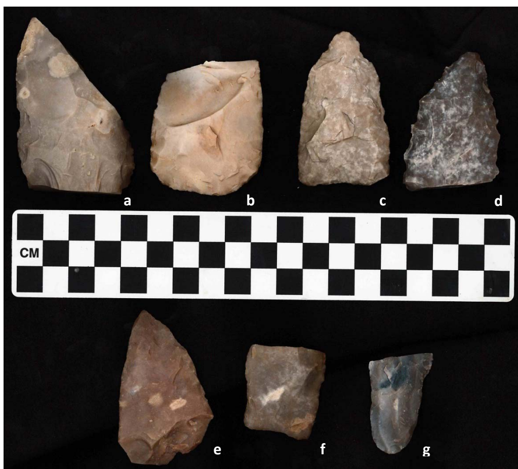
Figure 14: Bifaces from 41BX2131: a) EU 1, Level 2; b) EU 1, Level 5; c) Surface near ST 6 (JS2); d) ST 6 (JS2), Level 3; e) EU 1, Level 3; f) EU 1, Level 4; g) EU 1, Level 2.

Nineteen bifaces and fragments were encountered during both phases of investigation at site 41BX2131, with 15 of these from data recovery (Figure 14; see Appendix E). Thirteen bifaces were in Levels 2 through 6 in EU 1, while one each was in Levels 1 and 2 in EU 2. Many of these were complete, or nearly complete and fragmented, representing both manufacturing errors (see Figure 13 a, b, and e), and breakage during use. For example, Figure 13 (f and g) depicts the proximal ends of bifaces that likely snapped while hafted. Some biface examples were thicker than most, and may have been manufacturing failures that resisted being thinned further (see Figure 13 c), or may be preforms (Figure 15).