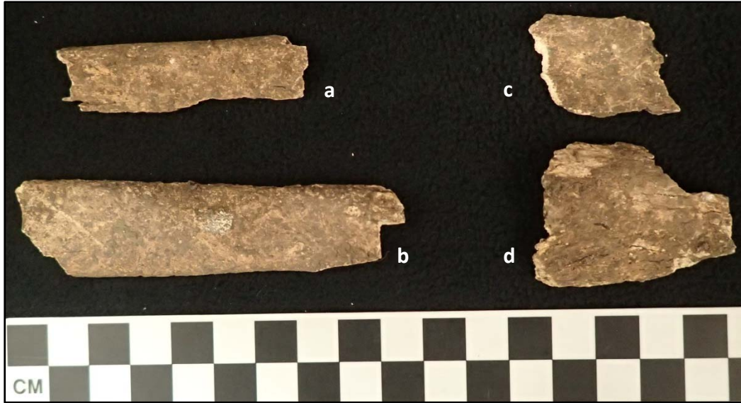
Figure 12: Large mammal rib fragments from 41BX2131: a-d) EU 1, Level 3.