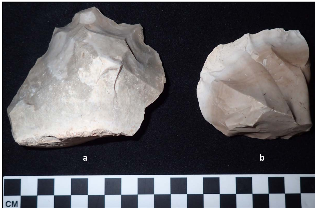
Figure 19: Hand Axes from 41BX2131; a) EU 1, Level 3; b) EU 1, Level 4.

Nine flake tools were documented during mitigation at the site 41BX2131 (see Appendix E). Three specimens each were in EU 1 at Levels 3 and 4, while one other was from Level 1 in EU 2, and two more were in Level 2 in EU 2. All three of the specimens from Level 3 of EU 1 retain some cortex. The largest flake tool appears to have been manufactured as a hand axe (Figure 19:a). Similarly, the flake tools from