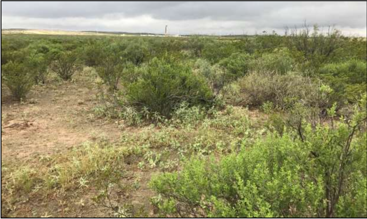
Figure 2-2. View along proposed ROW on GLO land, facing west