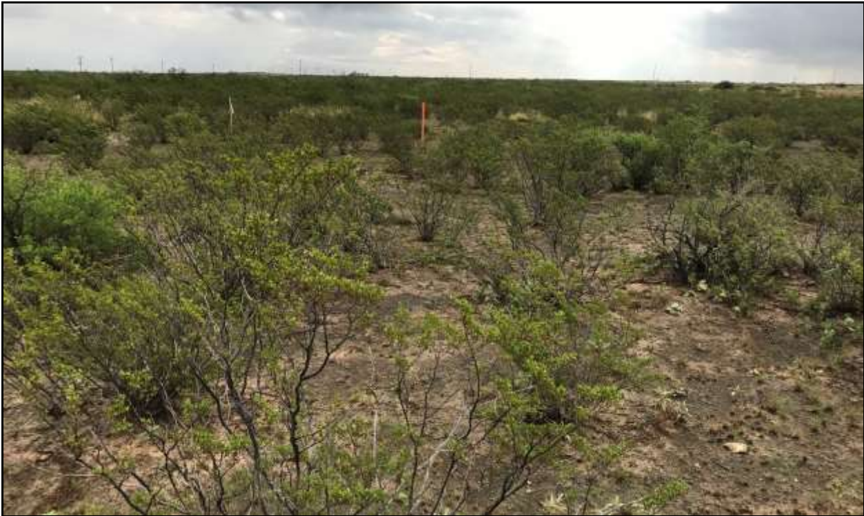
Figure 2-1. View along proposed ROW on GLO land, facing east