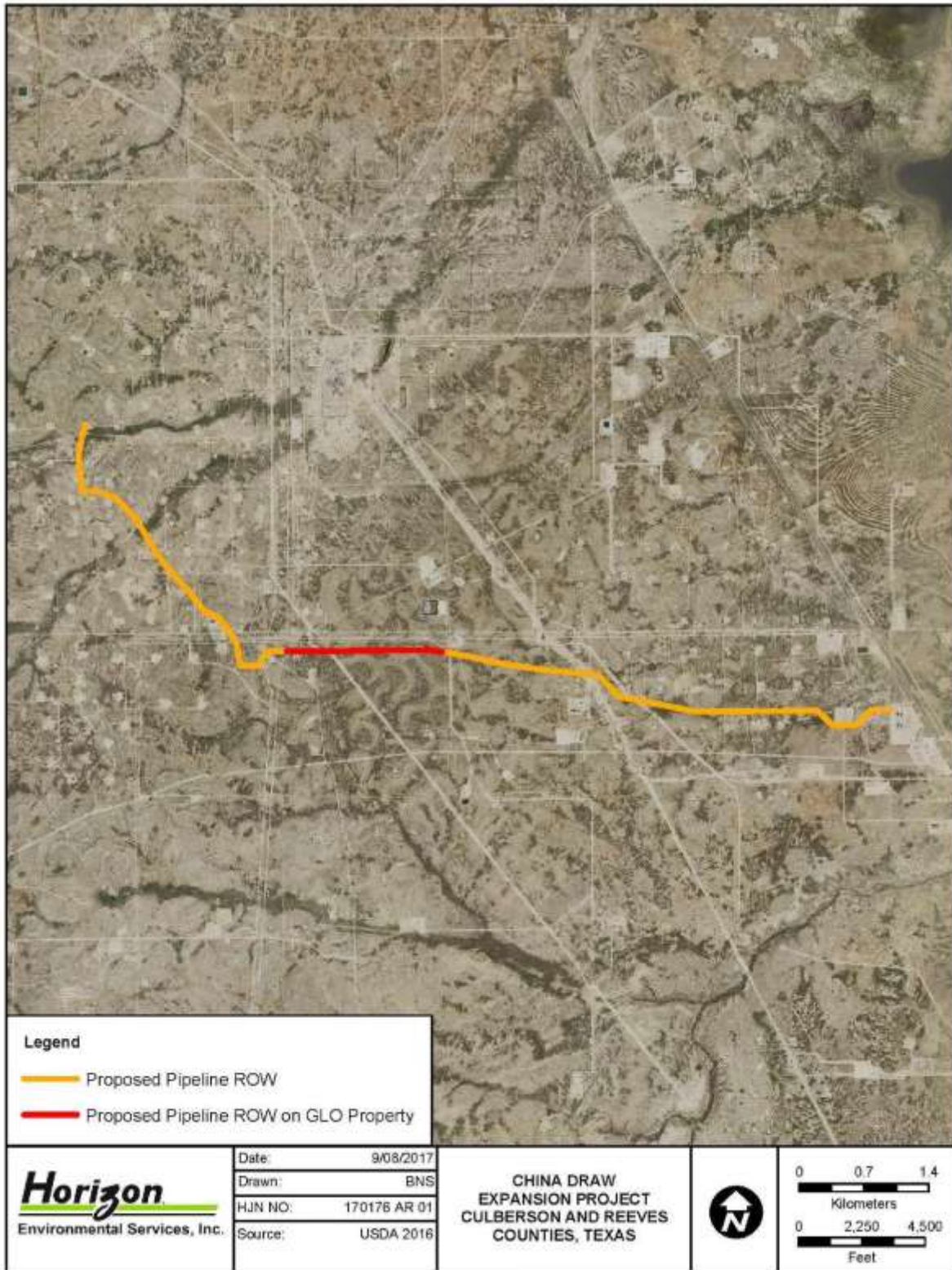
Figure 1-2. Aerial photograph with the location of the Project Area