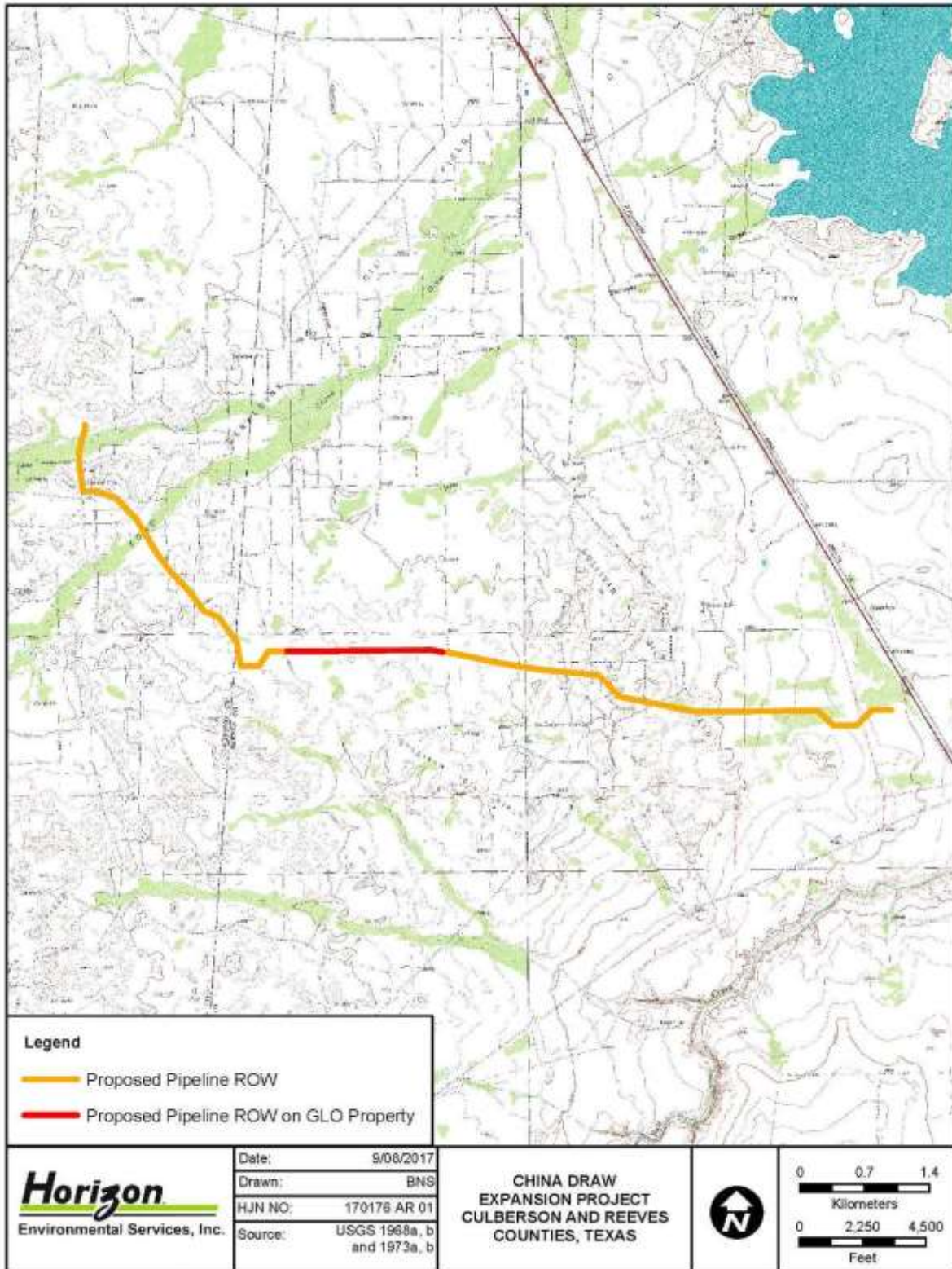
Figure 1-1. Topographic map with the location of the Project Area