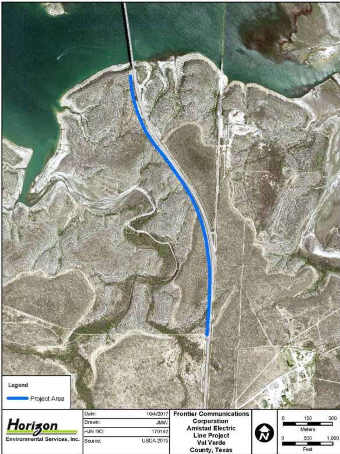
Figure 1-2. Aerial photograph with the location of the Project Area