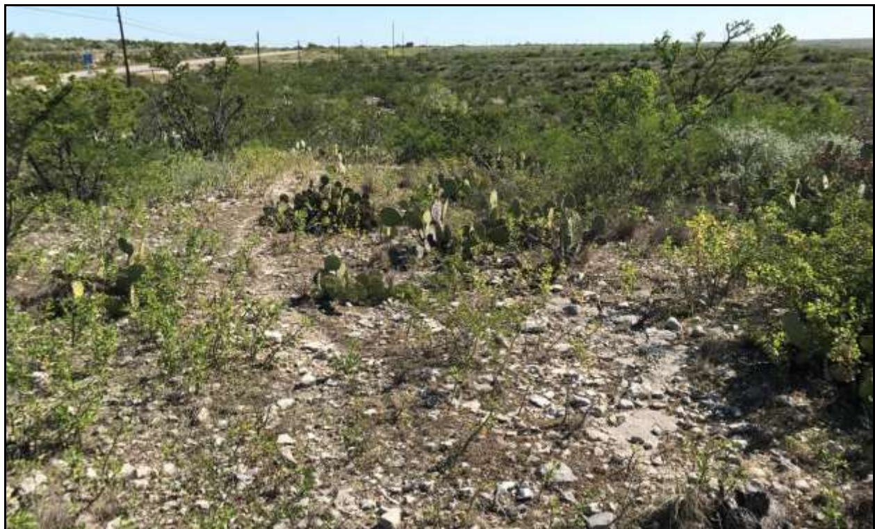
Figure 6-3. View of location of isolated chert flake, facing south