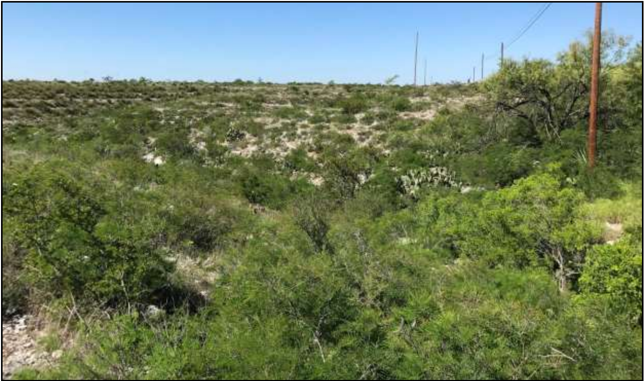
Figure 2-1. Typical view along Project Area, facing north