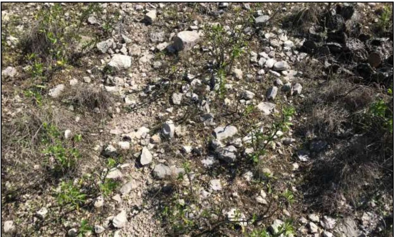
Figure 2-4. Typical view of ground surface within Project Area