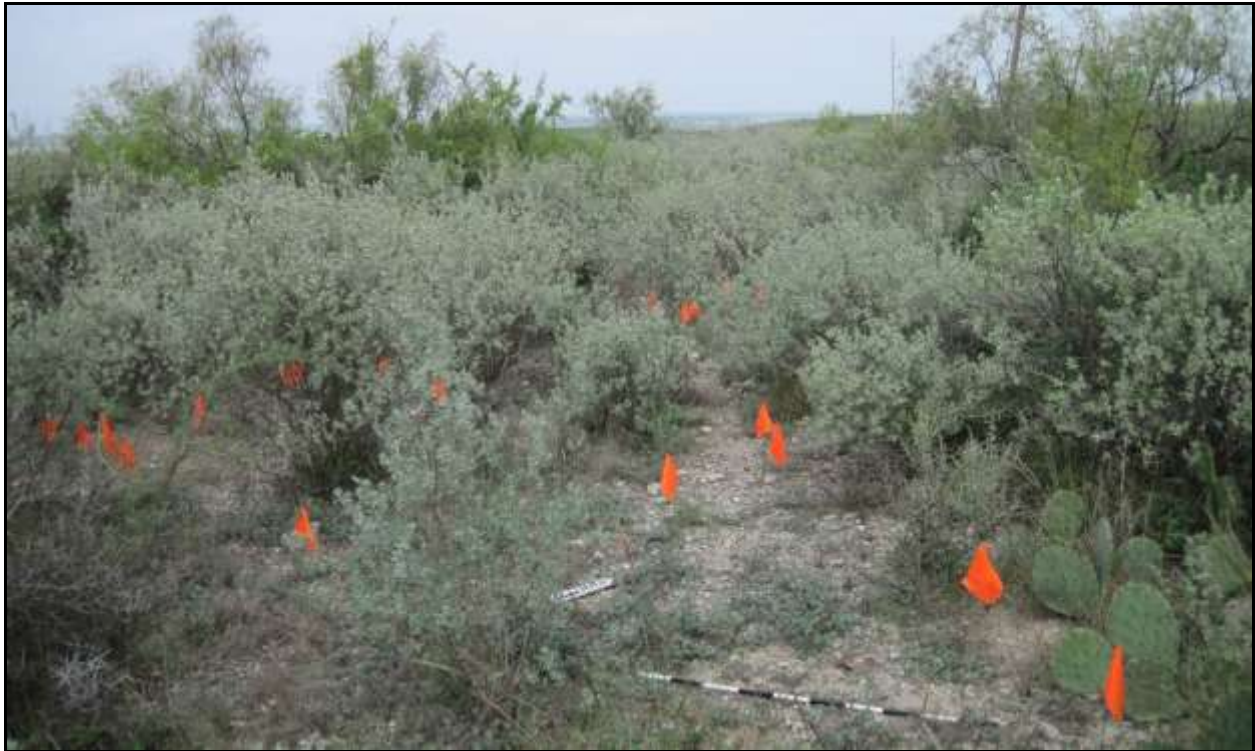
Figure 6-5. General view of area containing lithic scatter on site 41VV1222, facing north