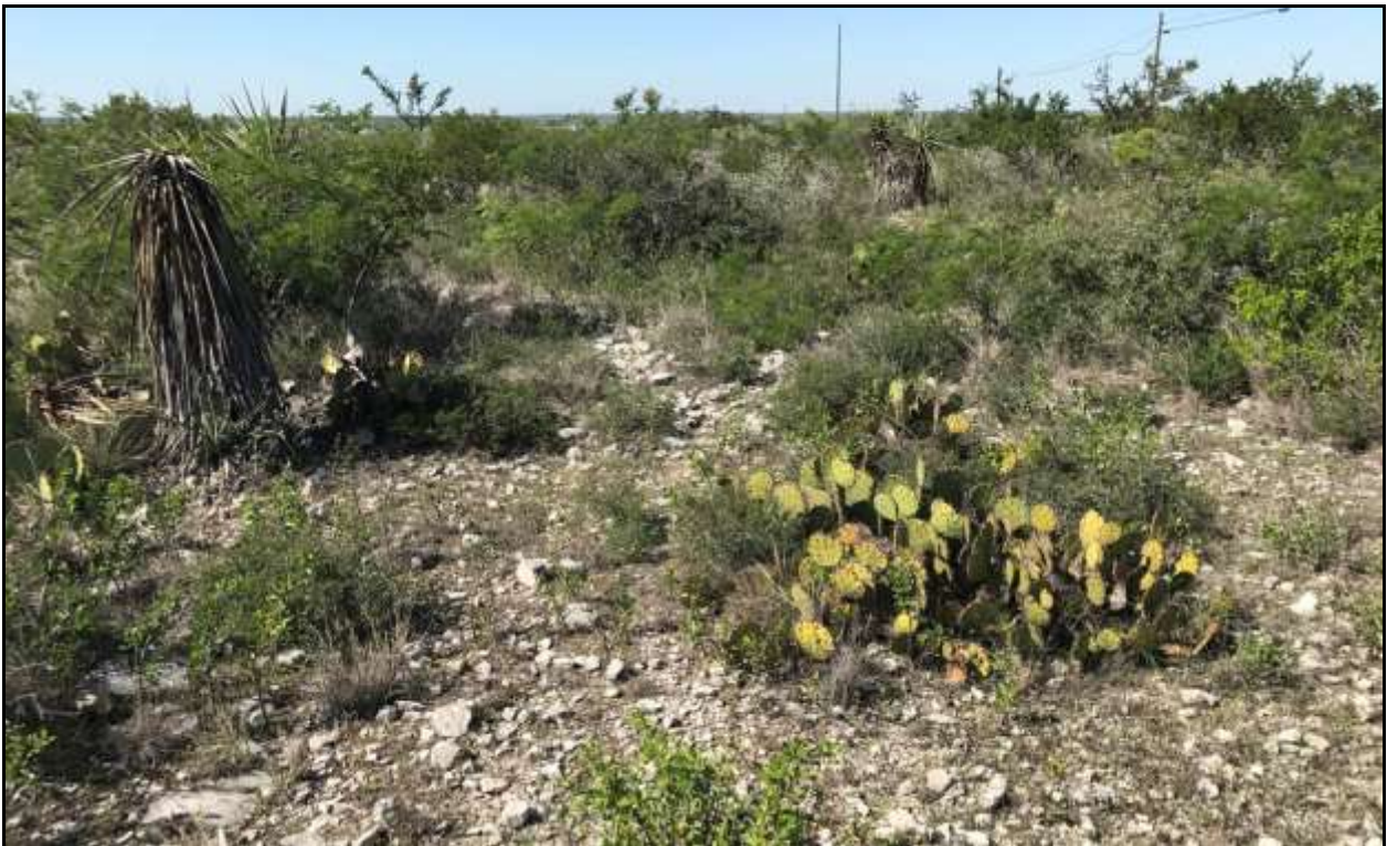
Figure 2-2. Another typical view along Project Area, facing north