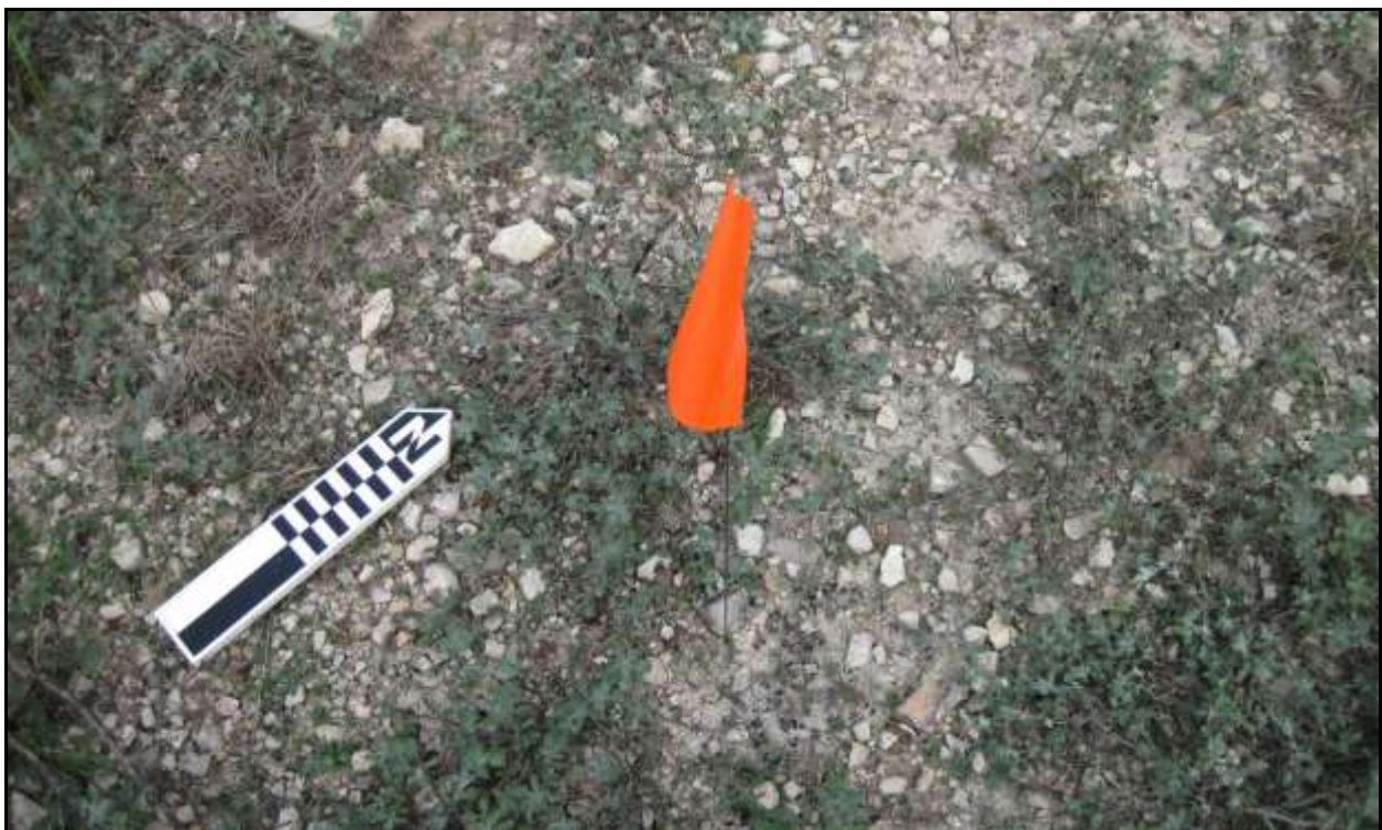
Figure 6-6. Example of lithic debitage observed on surface of 41VV1222