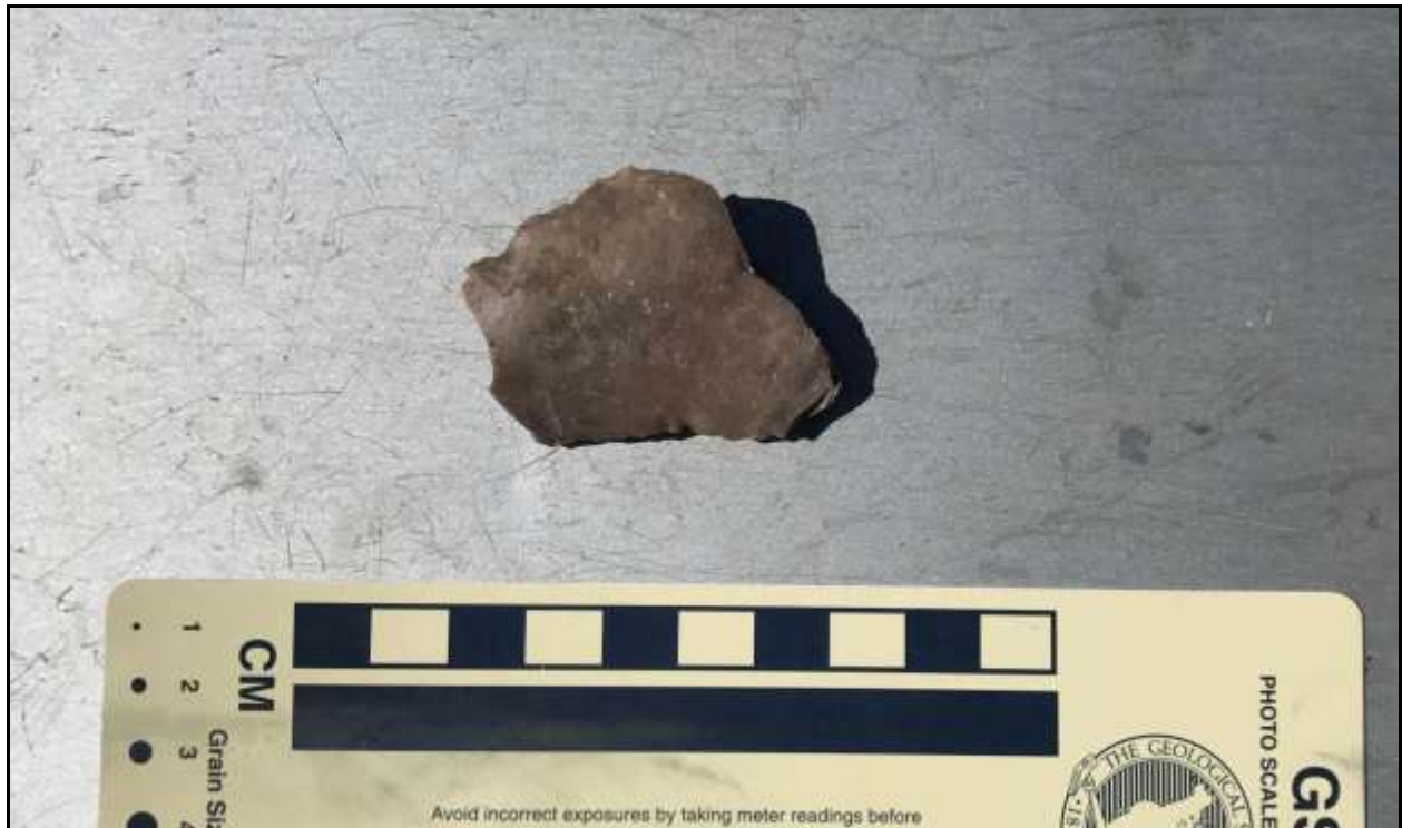
Figure 6-2. Isolated chert flake observed within Project Area