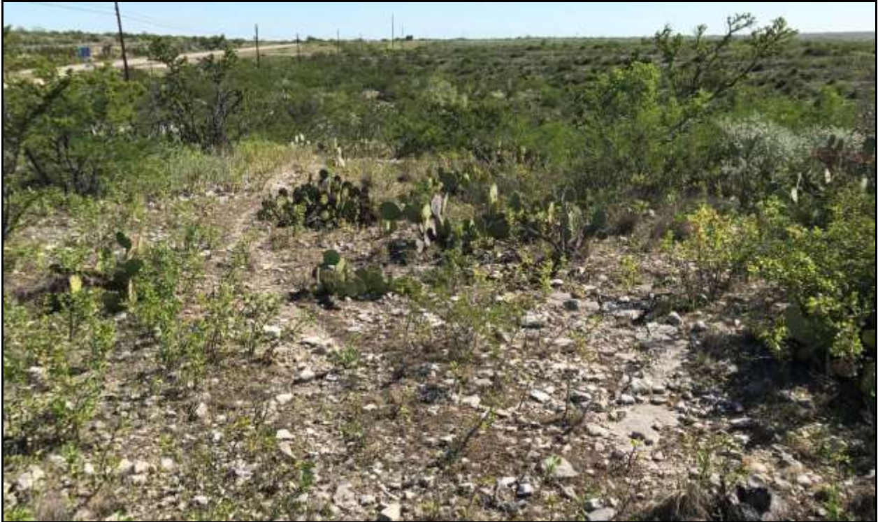
Figure 2-3. Typical view along Project Area, facing south