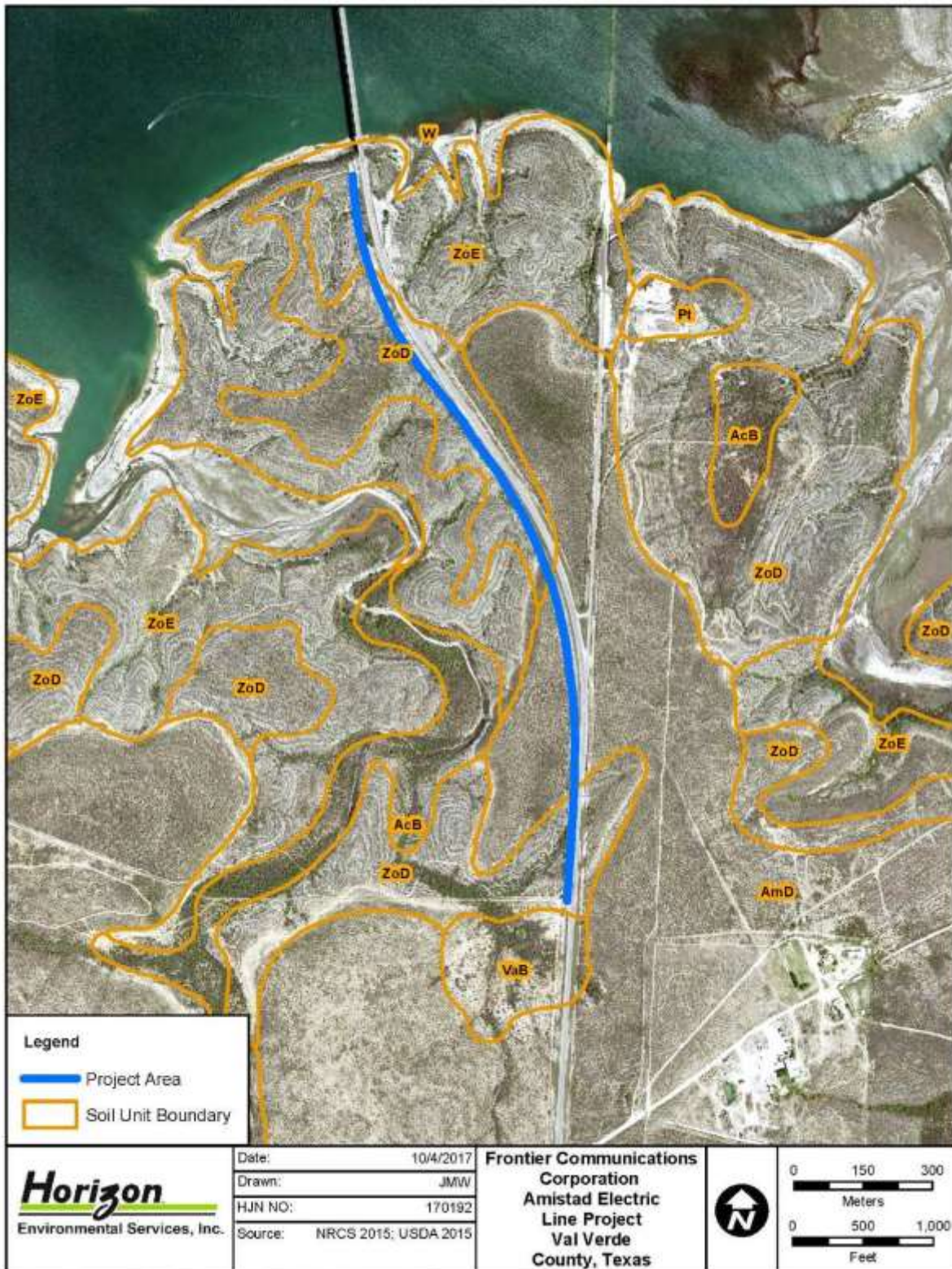
Figure 2-5. Soils mapped within the Project Area