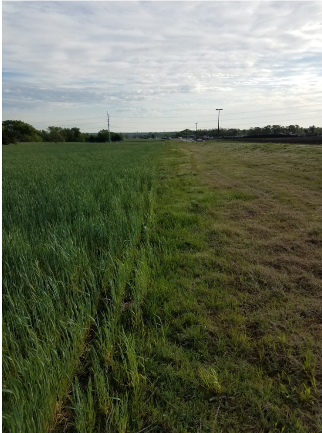
Figure 4-4. Overview of the Western End of the APE Showing the Cleared Road ROW and Mature Winter Wheat, Facing Northeast.

After approximately 0.3 mi along Shawnee Drive, the APE turns east across Shawnee Drive and continues eastward approximately 0.65 mi through agricultural land (Figure 4-5). The first field was fallow at the time of the survey, and three shovel tests were excavated. Continuing to the east, the surveyors encountered an active agricultural field containing young corn crops (Figure 4-6). Prior to entry, the landowner was contacted and specified that no access was permitted within this active field. As a result, the field was avoided and shovel testing resumed to the east in areas where no buried utilities were marked. The APE then turns south, following existing utility corridors and then eastward to cross North McDonald Street (SH 5).