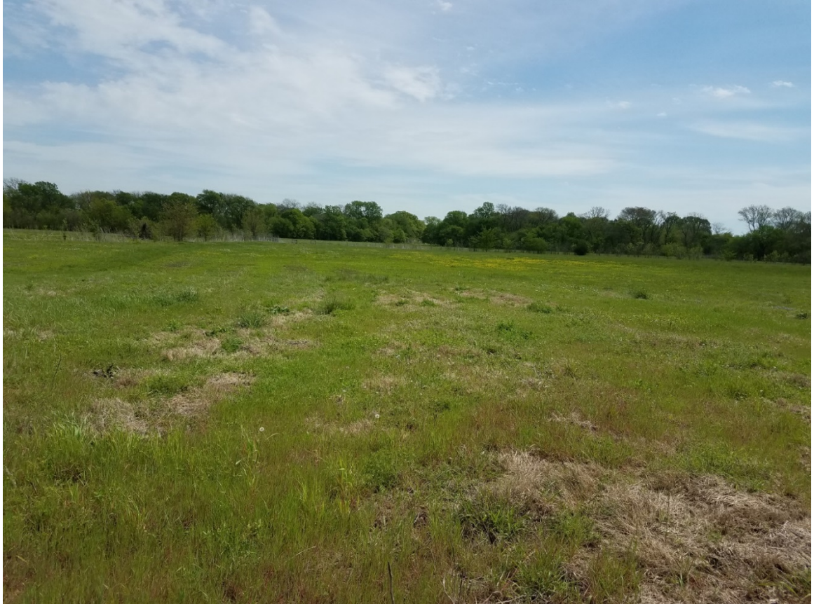
Figure 4-7. Overview of APE East of SH 5, Facing East Toward the Existing McKinney Eastside Extension Parallel Interceptor Wastewater Pipeline.

In total, 15 shovel tests were excavated within the NTMWD North McKinney Pipeline project APE. The most common shovel test profile encountered within the APE consisted of 0 to 35 cmbs black (10YR 2/1) clay underlain from 35 to 45 cmbs by dark grayish brown (10YR 4/2) clay with many calcium carbonate masses and few concretions (Figure 4-8). No cultural materials were encountered during the course of the intensive archaeological survey of the APE.