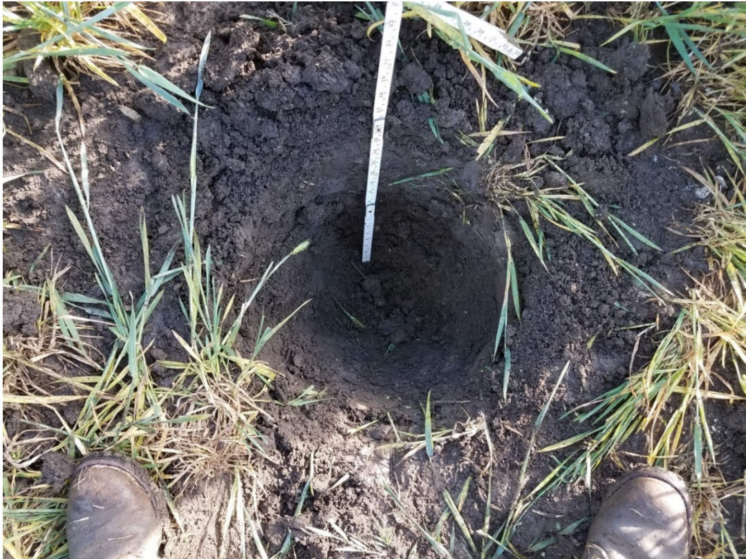
Figure 4-8. Shovel Test 2 Profile, Facing Down.