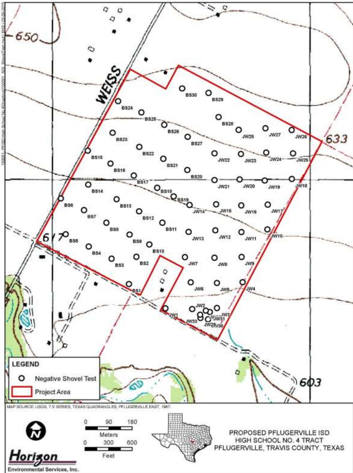
Figure 6. Locations of Shovel Tests Excavated within Project Area