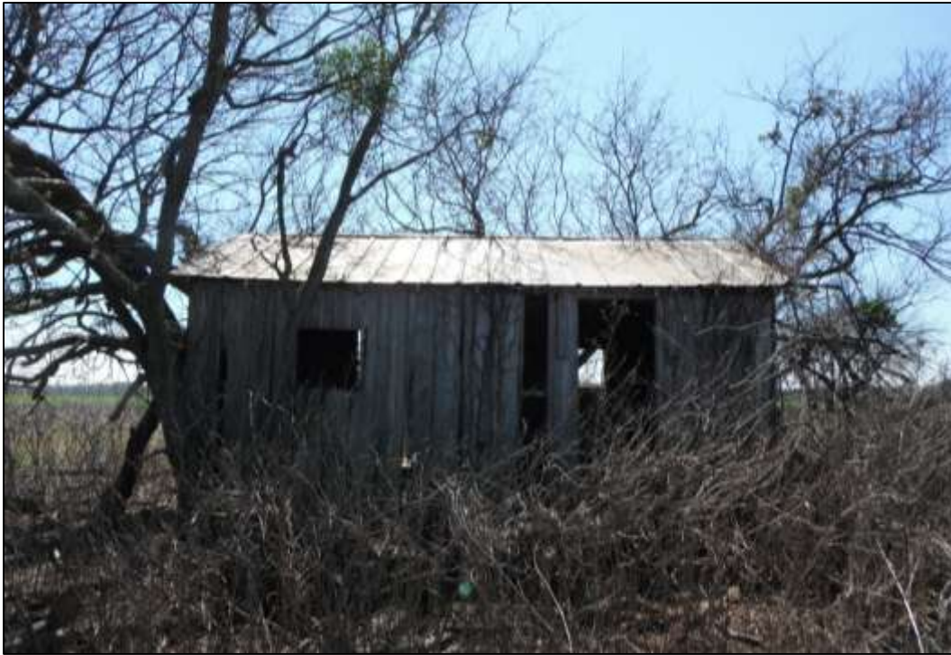
Figure 12. Northern Façade of House on Site 41TV2478 (Facing South-Southwest)