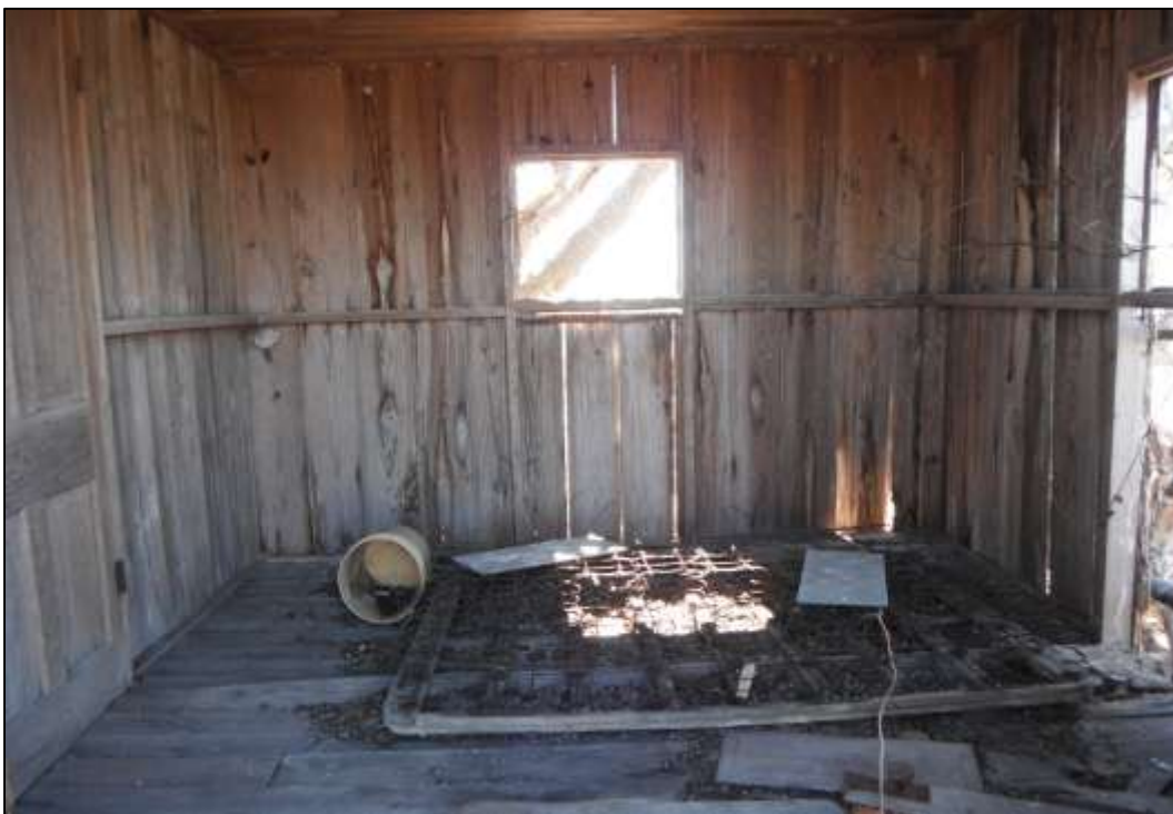
Figure 13. Western Room of House on Site 41TV2478 (Facing West)