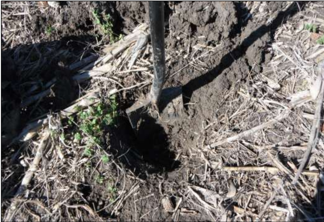
Figure 7. Typical View of Clayey Soils Observed in Shovel Tests

During the survey, field notes were maintained on terrain, vegetation, soils, landforms, survey methods, and shovel test results. Digital photographs were taken, and a photographic log was maintained. Horizon employed a non-collection policy for cultural resources. Diagnostic artifacts (e.g., projectile points, ceramics, historic materials with maker's marks) and non-diagnostic artifacts (e.g., lithic debitage, burned rock, historic glass, and metal scrap) were described, sketched, and/or photo-documented in the field and replaced in the same location in which they were found.