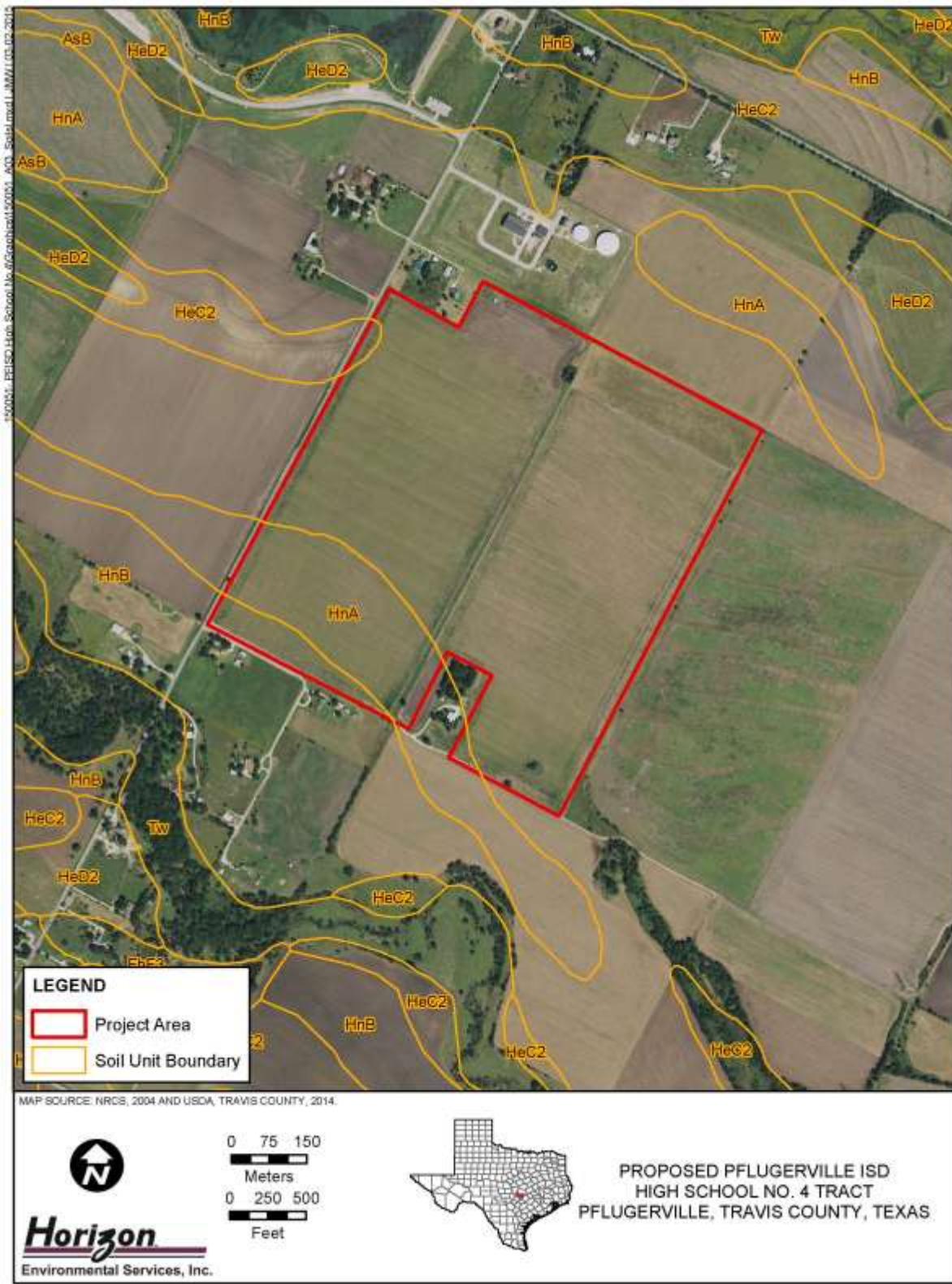
Figure 3. Distribution of Soils Mapped within Project Area