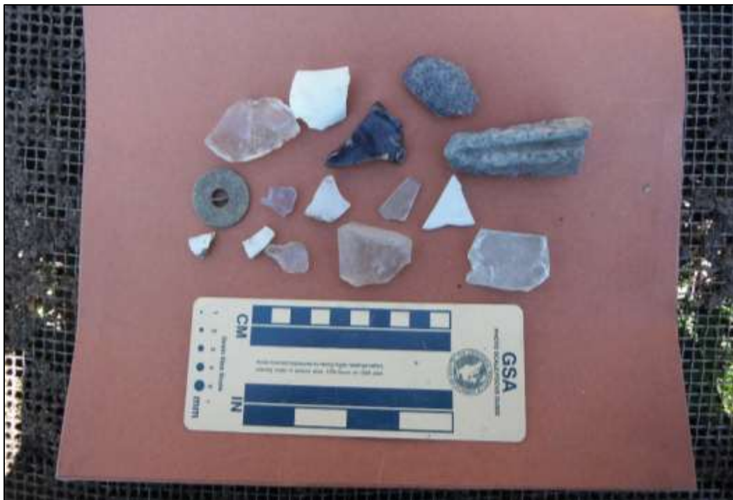
Figure 15. Glass, Ceramic, and Metal Artifacts Observed on Site 41TV2478