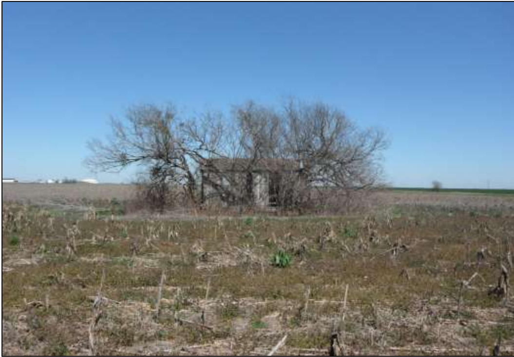
Figure 10. Overview of Site 41TV2478 (Facing North-Northeast)