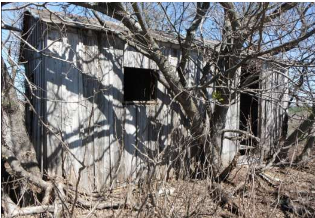
Figure 11. Southern Façade of House on Site 41TV2478 (Facing Northeast)