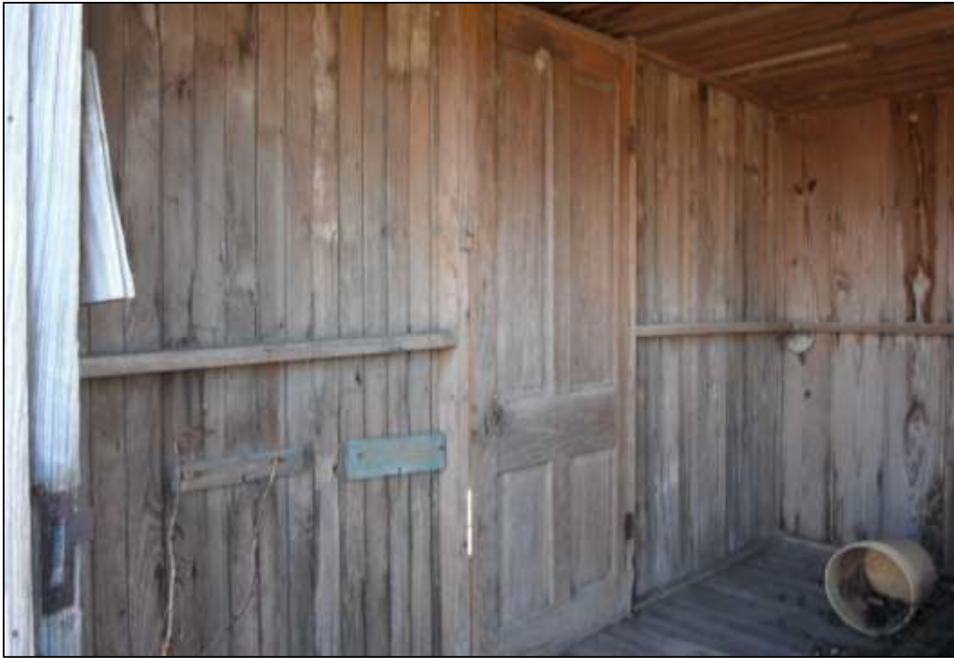
Figure 14. Interior Wall and Door of House on Site 41TV2478 (Facing Southeast)

paneling on the interior wall is in markedly better condition than the exterior paneling, suggesting that the interior wall may have been constructed at some time after the house was constructed. No exterior porches, overhangs, chimneys, or other features are present. Based on the small size of the structure, it is possible that it was intended to function as an equipment shed, but the final 2-room floor plan and the arrangement of windows and doors suggests that this structure represents the remnants of a tenant farmhouse situated on a larger farm.