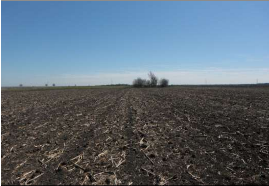
Figure 5. Characteristic View of Plowed Agricultural Field in Project Area (Facing SE)

was capable of fully penetrating sediments with the potential to contain subsurface archeological deposits, and it is Horizon's opinion that the pedestrian walkover with surface inspection and systematic shovel testing was adequate to evaluate the cultural resources potential of the project area. The Universal Transverse Mercator (UTM) coordinates of all shovel tests were determined using a hand-held Garmin ForeTrex Global Positioning System (GPS) device based on the North American Datum of 1983 (NAD 83). Summary data for all 63 shovel tests excavated during the survey are presented in Appendix A.