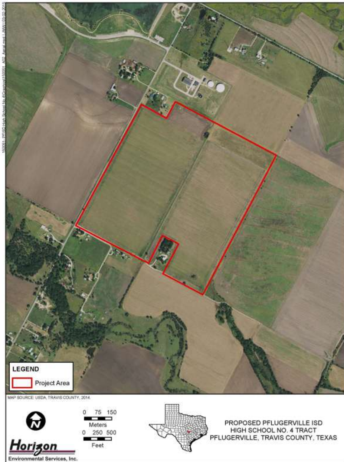
Figure 2. Location of Project Area on Aerial Photograph