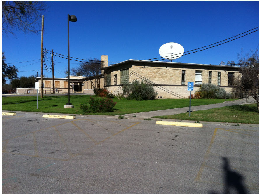
Photograph #3. Southwest facing elevation of the 1949 Uvalde Memorial Hospital.