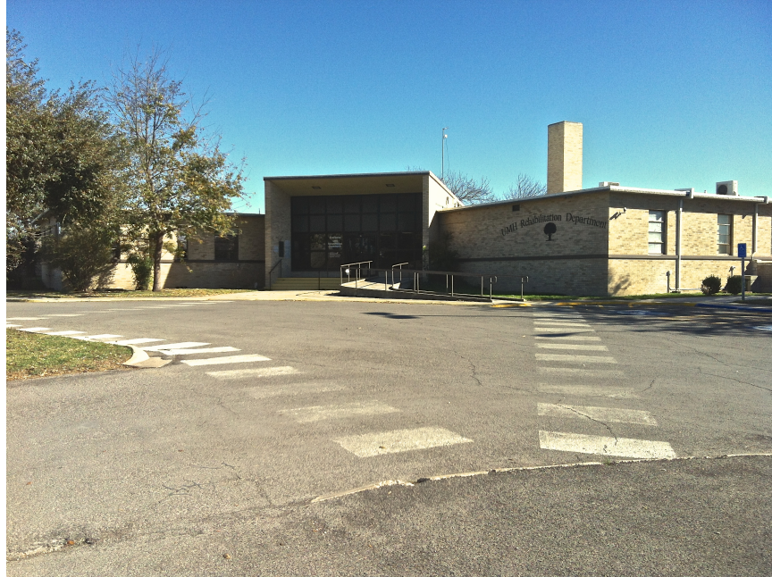
Photograph #1: Northwest facing front facade of the 1949 Uvalde Memorial Hospital.