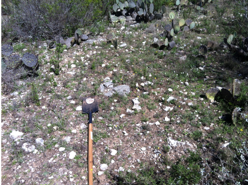
Figure 3: Example of ground surface visibility in areas of Olmos and Ector Soils