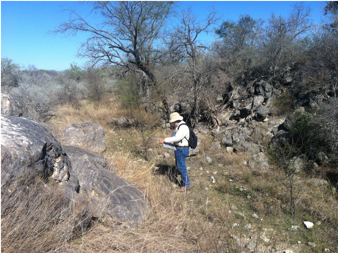
Figure 2: Archeologist standing in limestone quarry near southeastern edge of 11.5-acre survey area

An initial reconnaissance of the project area at the beginning of the field survey showed that an approximately 75x70 meter area on the eastern edge of the project area had been mined for limestone and caliche as several deep pits, trenches and backdirt piles were evident (Figure 2). Elsewhere, two piles of recently burned debris mostly from brush clearing work were evident in the northwest and far northcentral edges of the tract. It is probable that there have been earlier episodes of brush clearing activities and subsequent burning of brush piles on the tract. As a result, some burned rock fragments seen across the project area may result from recent burning as opposed to prehistoric activities. The reconnaissance also indicated that ground surface visibility is highly variable ranging from very good, due to former cultivation and brush clearing, to poor where thorny brush, sage, and cacti are thick (Figures 3 and 4).