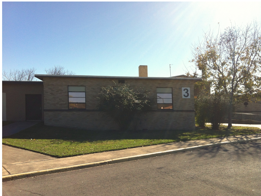
Photograph #2: Northwest facing elevation of the 1949 Uvalde Memorial Hospital.