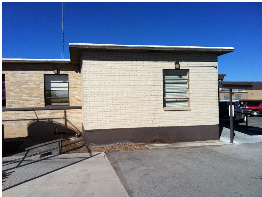
Photograph #4. Rear addition to the 1949 Uvalde Memorial Hospital showing new addition.