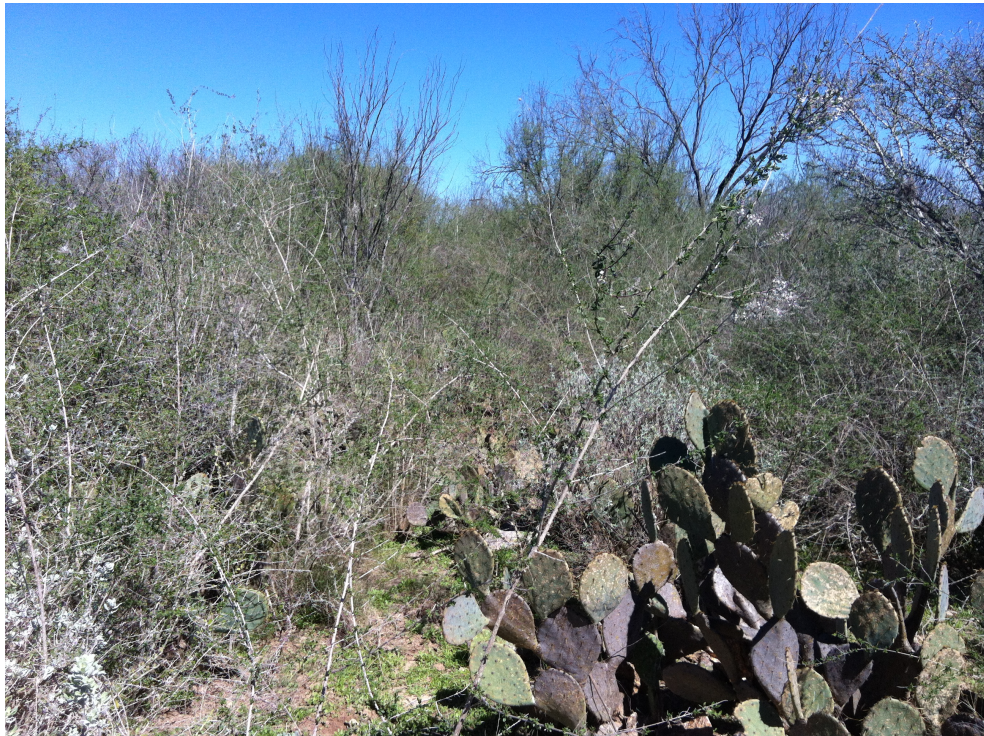
Figure 4: Example of area with thick vegetation in project area