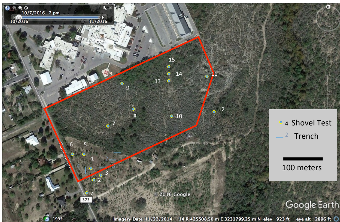
Figure 5: Location of subsurface tests in 11.5 - acre APE

AAIS had originally proposed to excavate at least two backhoe trenches which were to be placed in the APE area nearest Taylor Slough to check for more deeply buried cultural deposits. Because the initial reconnaissance showed that all of the eastern part of the project area closest to Taylor Slough consisted of either limestone/caliche quarries or Olmos-Ector soil areas with shallow, rocky topsoils, the proposed backhoe trenching was, instead, undertaken at the location of site 41UV505, which was the only cultural resource recorded and assessed during the survey. This site will be described in the section that follows.