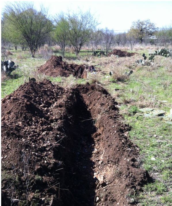
Figure 6: Site 41UV505 showing backhoe trenches 2 and 3

Following the surface survey, six shovel tests consisting of ST #s 1-6 and four backhoe trenches, BHT #s 1-4 were excavated to evaluate subsurface deposits (Figure 6). ST #1, 3 and 4 yielded small numbers of artifacts with one small burned rock in Level (L) #2 of ST #1 and one small burned rock each in L #1, 2 and 3 of ST #3. ST #4