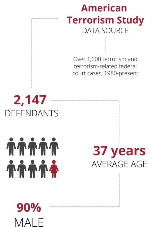
FIGURE 1 DATA OVERVIEW

Data include a sample of 2,147 defendants in terrorism-related cases across several types of legal measures: charge type, number of charges, whether or not the prosecutor references terrorism (e.g., relying on terrorism statutes or referring to a defendant's association with a terrorist movement during adjudication), joint or single prosecution, bail, conviction outcome, and sentence length. While several types of analyses were conducted, only descriptive statistics are presented in this brief.