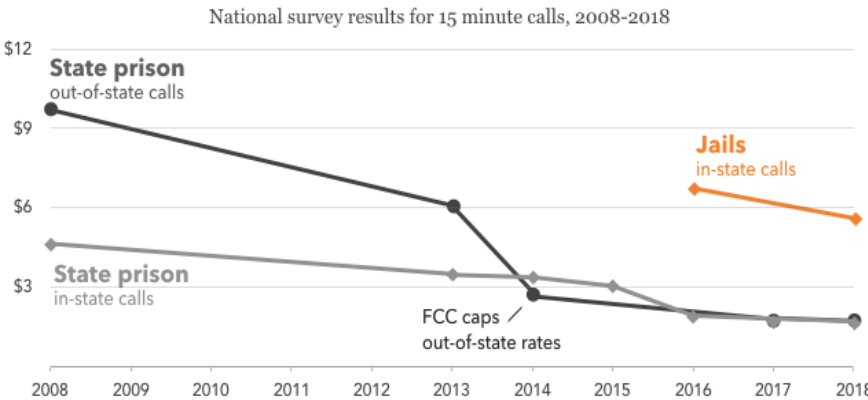
Figure 2: Report by Prison Policy Initiative (prisonpolicy.org), table developed from results of their nationwide surveys. See: (https://www.prisonpolicy.org/phones/state_of_phone_justice.html#m ethodology) for data collection methods. Reprinted with small-scale general permissions: https://www.prisonpolicy.org/reprints.html

some progress made in lowering the costs of phone-calls. This is an issue that prison advocates are deeply concerned about, as we know that communication, either with an attorney, family member, or other outside person can be the difference between life and death. Notably, the Federal Communications Commission (FCC) has recently capped fees [see figure 2] and costs after pressure from prison reform initiatives (Wagner & Jones 2019). Those who work on prison policy initiatives are also interested in addressing the communication problems faced by those who have been jailed awaiting trial. Charging exorbitant amounts for legally innocent people awaiting trial, Wagner and Jones argue, "punishes people who are legally innocent, drives up costs for their appointed counsel, and makes it harder for them to contact family members and others who might help them post bail or build their defense" (2019).