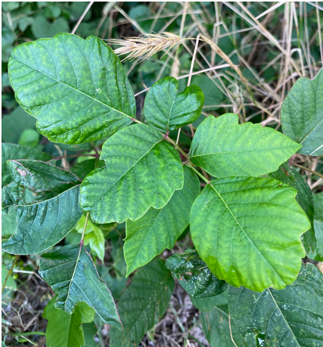
Figure 3. Poison oak in the spring/summer with lobed edge leaflets.