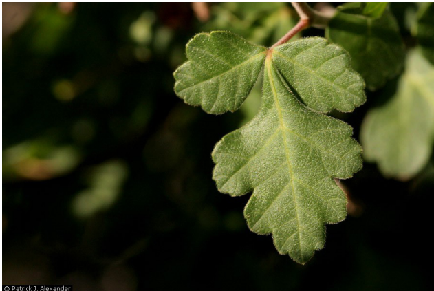
Figure 8. Skunkbush sumac has lobed edge leaflets.