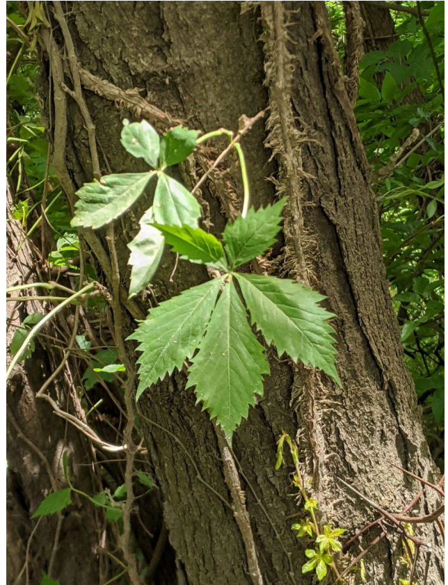
Figure 5. Virginia creeper has toothed edge leaflets.

are Virginia creeper, fragrant sumac, skunkbush sumac and boxelder.