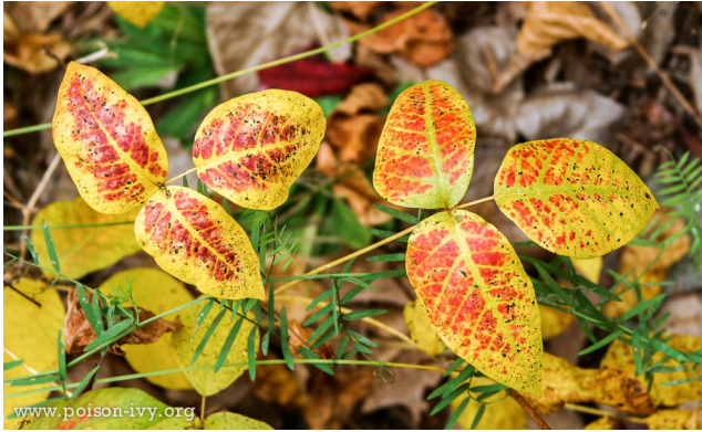
Figure 2. Poison ivy in the autumn. It has smooth-edged leaflets.