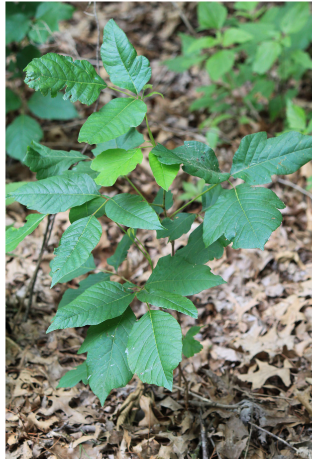
Figure 1. Poison ivy in the summer. This poison ivy has lobed edge leaflets.

Poison ivy leaves are compound and consists of three individual leaflets (Figure 1). The leaves can vary from smooth to being lobed (looking like a pair of mittens) or toothed (pointed). Poison oak leaves are usually in clusters of three leaflets. Its leaves are lobed or deeply toothed, with rounder edges (Figure 3). Just as leaf shape varies, so do the colors of leaves on each plant. Poison ivy leaves start out a shiny green in the spring and become a dull green during the summer. In the autumn, poison ivy leaves turn yellow or scarlet (Figure 2). Poison oak is green throughout the spring and summer