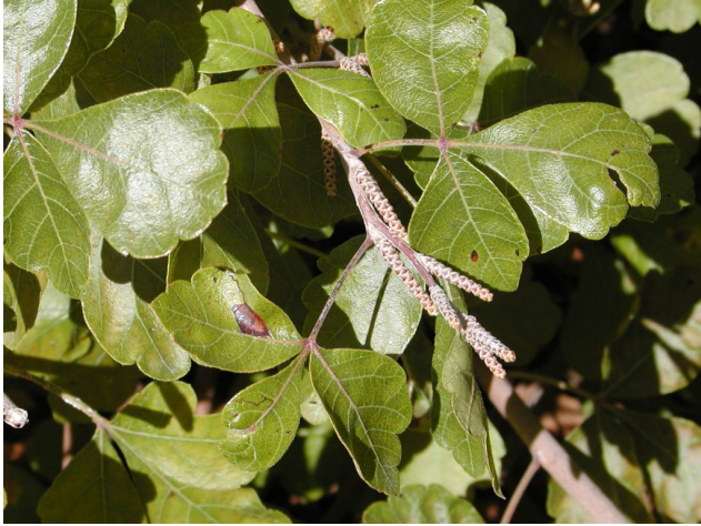
Figure 6. Fragrant Sumac has toothed edge leaflets.