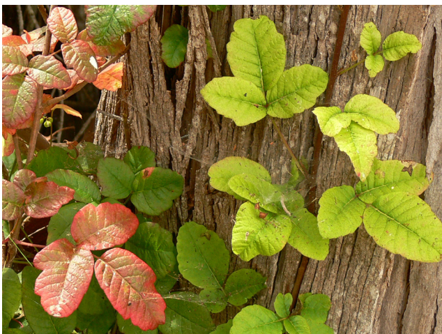
Figure 4. Poison oak in the autumn.