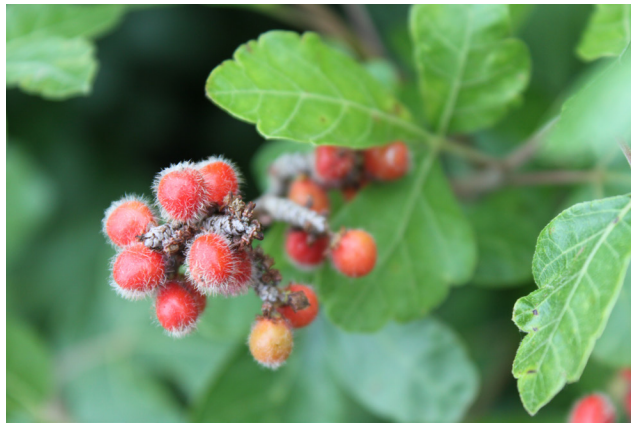
Figure 7. Fragrant sumac with berries. It has tooth-edged leaflets.