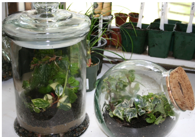
Figure 2. Larger plants can be used as a focal point in the center of a terrarium to be viewed from all sides.

Gently remove the plants from their pots, avoiding damage to their root systems. Plant the taller, vertical plants first to