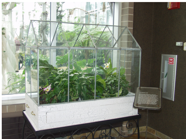
Figure 1. A Wardian case for transporting and maintaining plants.

A terrarium, a garden in an enclosed glass or plastic container, is a delightful way to grow a collection of small plants. With proper care, a terrarium will create a humid atmosphere that protects tender, tropical plants that are difficult