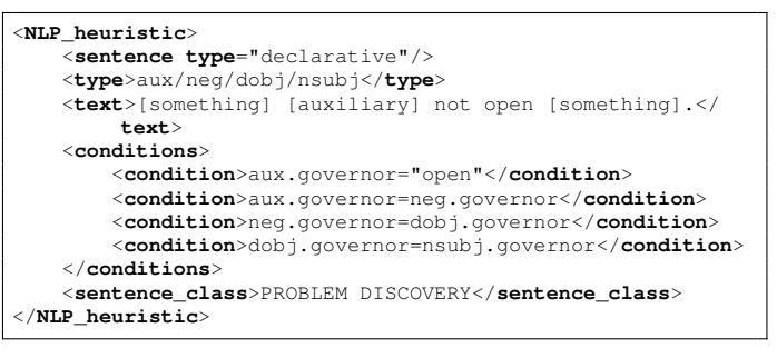
Fig. 2. Example of NEON rule in XML

<sup>1</sup>https://nlp.stanford.edu/nlp/javadoc/javanlp/edu/stanford/nlp/semgraph/ SemanticGraph.html