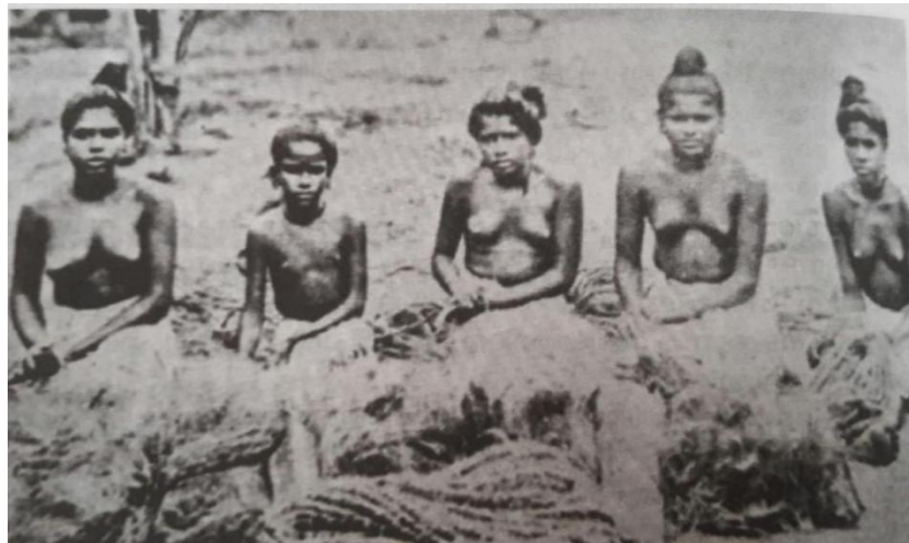
Figure 2: Subaltern Women Engaged in the Making of Coir

Finally, half a century-long the Channar Lahala ended in victory for Dalit women on 26 th July 1859; all restrictions on Channar women’s dress code were abolished through a royal proclamation issued by King Uthram Thirunall (1814-1860). The British administration had put tremendous pressure on the Travancore Government. Governor Lord Harison (1810-1872) himself had written to Travancore Resident General Kallan (1785-1862) seeking an explanation from him for the revolt.