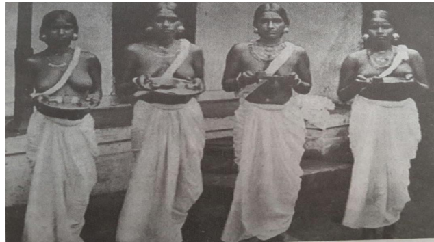
Figure 3: Four Upper Caste Women participating in a Procession as Part of a Temple Festival

Though the Channar revolt officially ended with the proclamation of 1859, upper-caste women were denied the right to use the upper cloth for several years and this custom continued even in the post-independence period in Manimalarkavu in Thrissur, where the women participating in the procession as part of the temple festival were not allowed to cover their breasts. This had led to protests, and the practice ended.