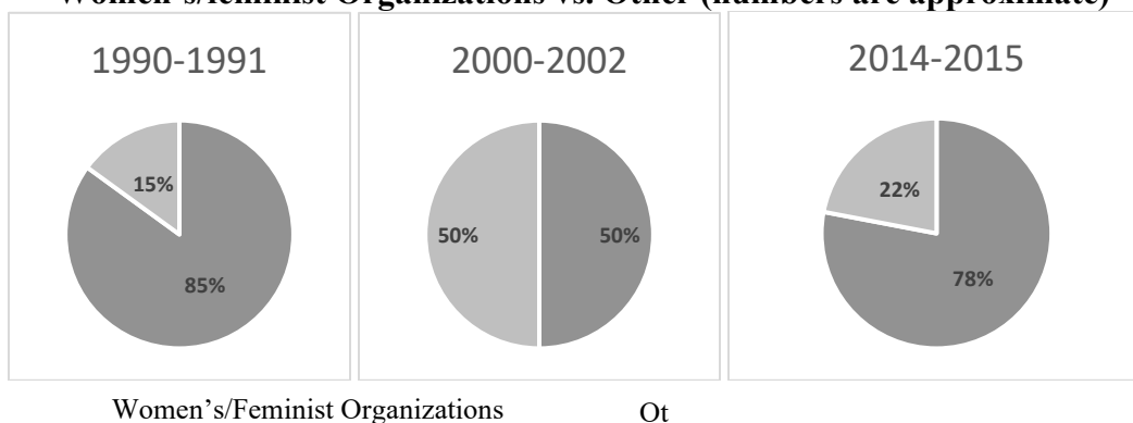
Chart 1: Provincial Funding (Ontario) for Gender-based Violence Work – Women's/feminist Organizations vs. Other (numbers are approximate)

Simultaneously, between 1990 and 2015, cultural organizations (identified here as groups organized around an ethnic, linguistic, or religious affiliation) experienced a gain in provincial grants for work focused on gender-based violence. While there is some overlap between the two