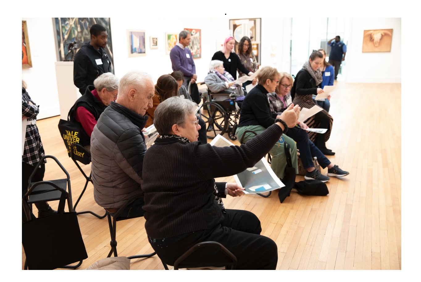
Figure 1. Gallery Teachers, art therapy students, and resident physicians engage in close looking activities with participants.

reflective conversation in which participants along with care partners share with the group what they made and what it means to them. In addition to this two-part structure, each session of the program includes four common elements: sessions are anchored in the art encounter, accessible, responsive, and experiential.