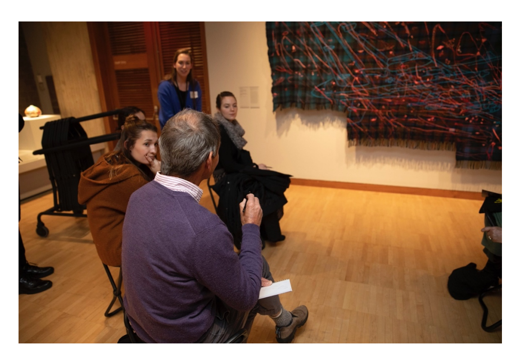
Figure 2. The museum has foldable stools on rolling carts that are wheeled to each object so that participants can walk without carrying them.