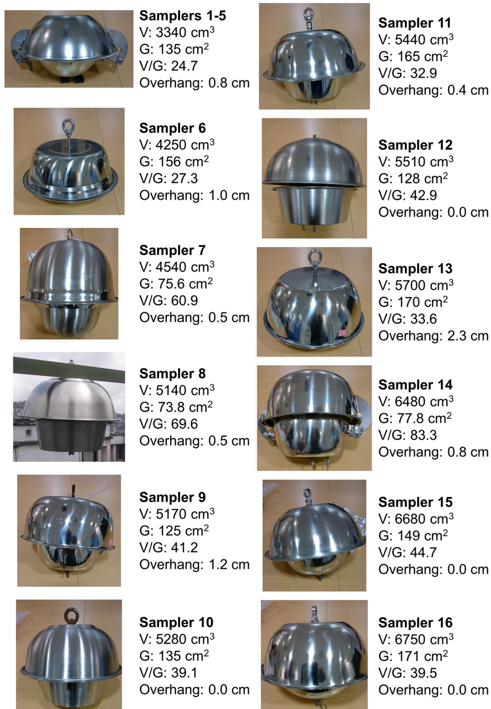
Fig. 1. Sampler designs used in the study and their basic dimensions. V indicates volume, G indicates the area of the horizontal gap between upper and lower dome, V/G is the ratio of the dome volume to gap area, and overhang is the distance the upper dome extends over the lower dome.

All PUF disks were analyzed according to accredited analytical methods (ČSN EN ISO 17025: 2018) for 8 PCB congeners (7 indicator PCBs + PCB 11), 12 OCPs (chlorobenzenes, hexachlorocyclohexanes - HCHs, dichlorodiphenyltrichloroethane and associated metabolites - DDX compounds), 29 PAHs and 10 PBDE congeners; compounds are