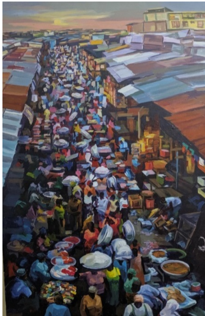
Figure 3. Evening Scene: Preparation