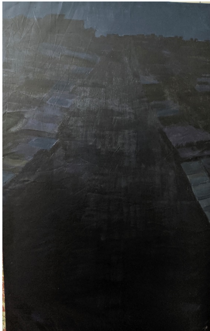
Figure 4. Night: Death