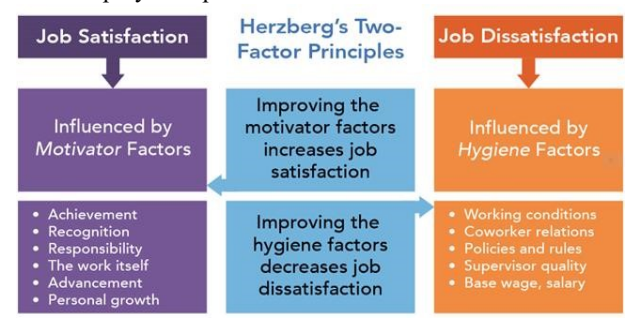
Figure 1: Frederick Herzberg's Two- Factor (Motivation-Hygiene) Theory 4.0 DISCUSSION AND ANALYSIS

work (Armstrong, 2010). Herzberg (2003) stated that intrinsic factors associated with job satisfaction are based on two types of motivators, i.e., factors that determine job satisfaction and factors that cause employee dissatisfaction at work, while external factors relate to dissatisfaction. Herzberg concluded from satisfactory performance that removing satisfactory performance from unsatisfactory work is satisfactory work (Armstrong, 2010). Herzberg defined two main variables: motivators of hygiene variables that can contribute to job satisfaction (Herzberg, 2003). Herzberg noted that motivators are intrinsic factors that encourage psychological growth and job creation, such as success, appreciation, responsibility, improvement, challenge, and work itself (Ajila & Abiola, 2004). On the other hand, hygiene variables are external and working conditions are exactly the same (Armstrong, 2010). These include job security, salary, working conditions, company policy, management, supervision, relations between subordinates and supervisors (Bhattacharyya, 2009). Herzberg (2003) concludes that employees should not only worry about working conditions, but also about the job itself. According to Chris and Awonusi (2004), external incentives have a large effect on employee dependence, while internal rewards do not have a significant impact on employee impact.