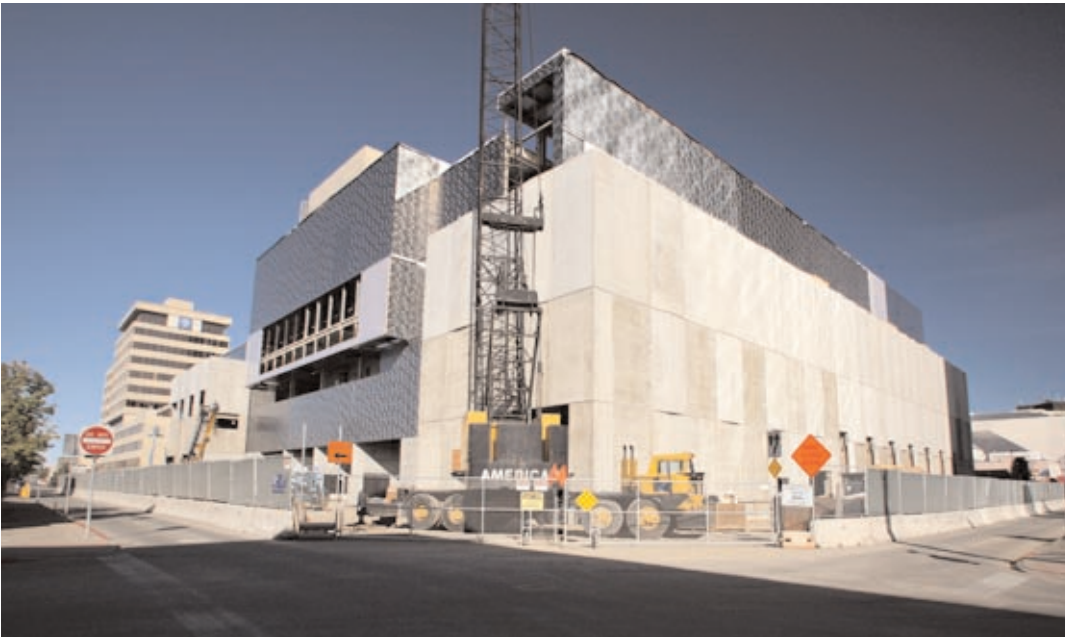
Dena'ina Convention Center, Anchorage

have stimulated interest in exploration and expansion of existing mines.