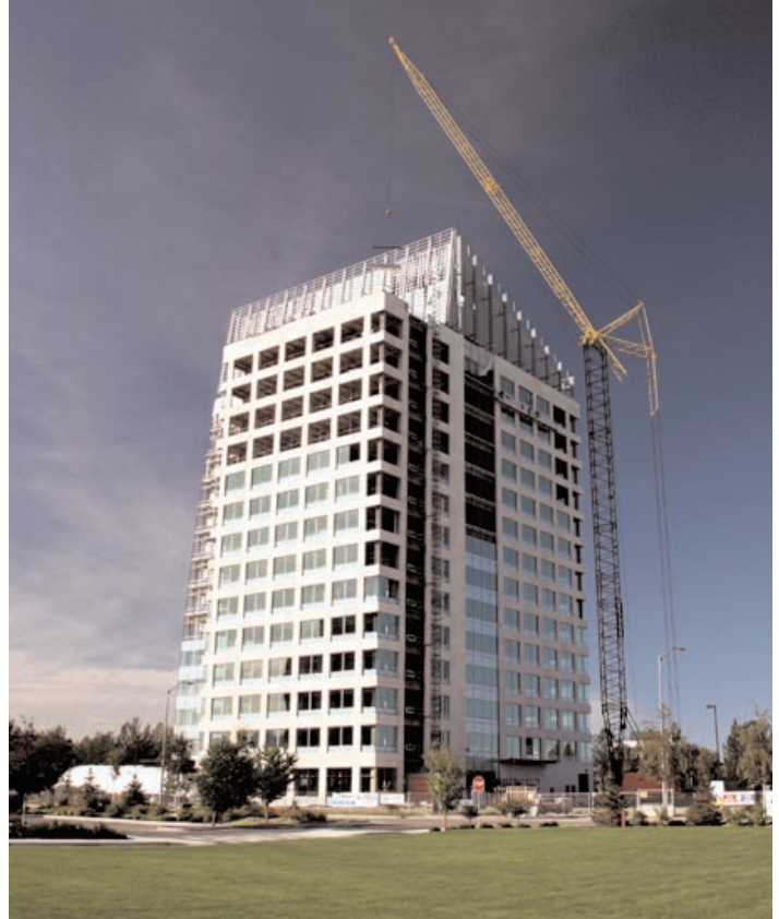
J L Tower, Anchorage

federal government—creates an incentive for companies to find more gas to feed that export market. (This should also have the benefit of increasing the supply of gas for the domestic market.) The high price of oil is also stimulating companies to look for oil in Cook Inlet.