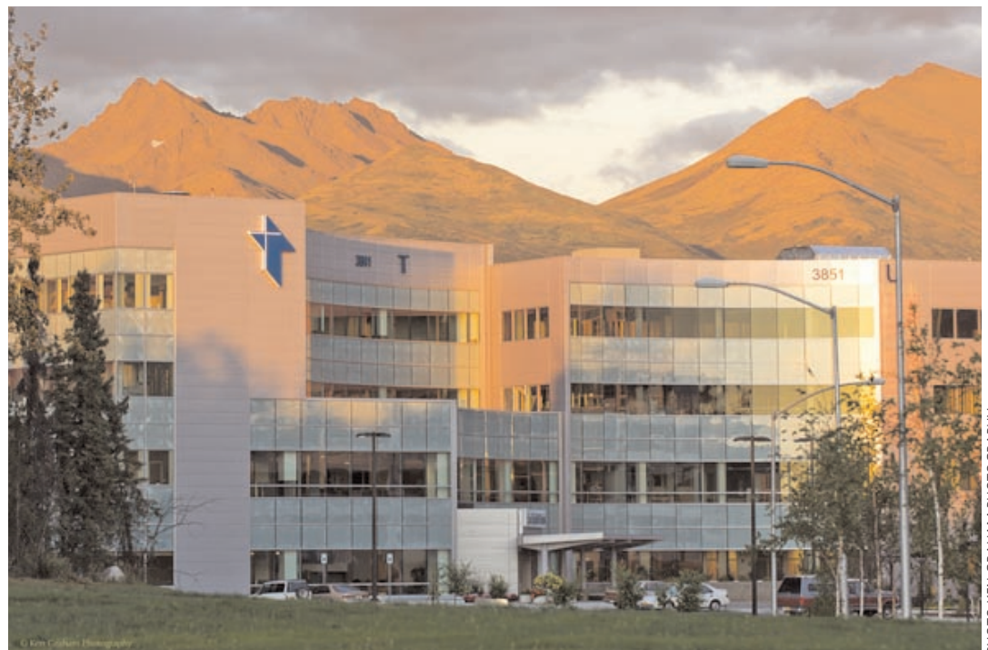
Providence Hospital addition, Anchorage

The Denali Commission, created by Senator Ted Stevens to more efficiently direct federal capital spending to rural infrastructure needs, will spend about $90 million for construction, down 10%.