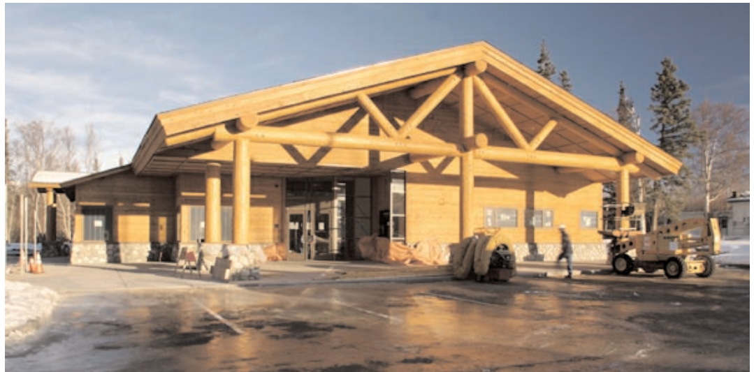
Alaska USA Building, Palmer

until demand can grow to absorb the excess supply that has accumulated in recent months.