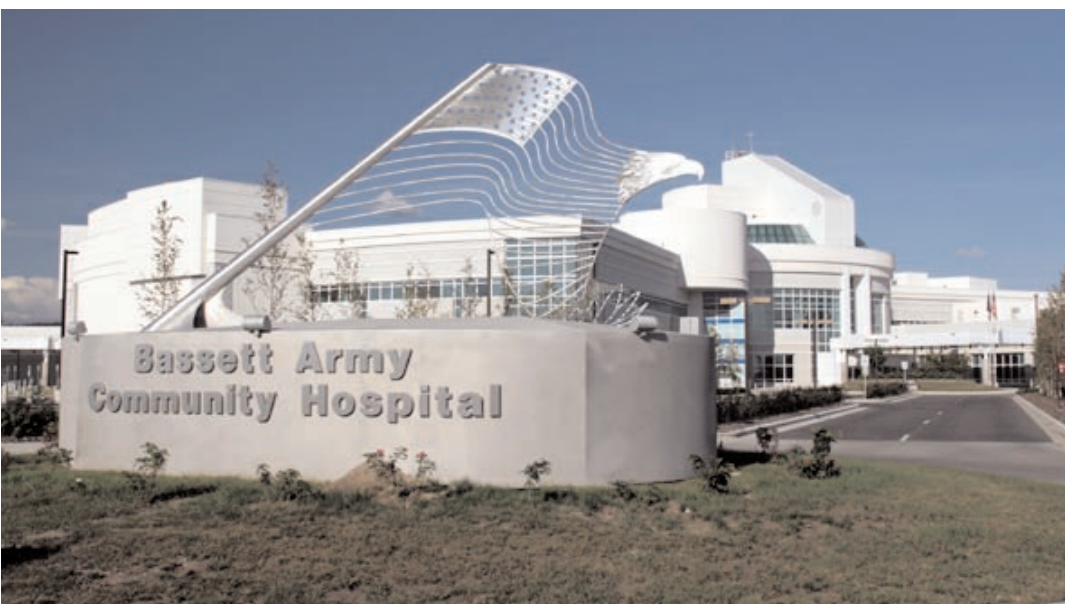
Bassett Army Hospital, Fairbanks

Most other private, public, and nonprofit hospitals around Alaska have smaller 2008 capital budgets. Expansions of the hospitals in Juneau and Homer represent the most significant other additions in this category.