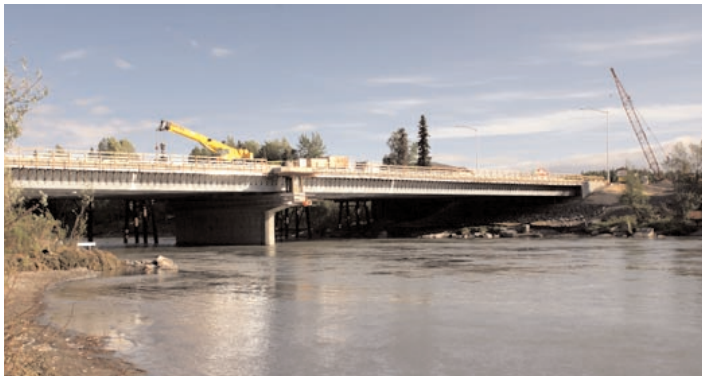
Kenai River Bridge, Soldotna

We expect state-funded construction spending that is based neither on federal grants nor related to transportation or education to be about $180 million. That's slightly higher than in 2007 and assumes a number of larger projects, including two fish hatcheries in Anchorage and Fairbanks, will get underway. These projects fall primarily in the Departments of Commerce, Community, and Economic Development,