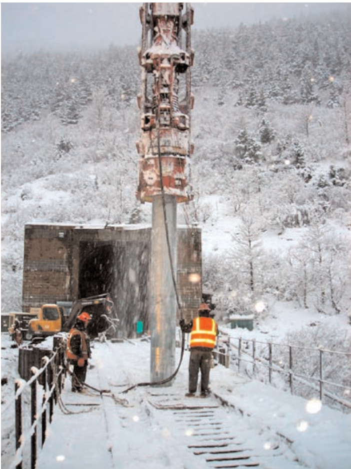
Alaska Railroad Bear Valley Bridge, Portage

Local government capital spending, from general funds as well as enterprise funds, is estimated to be $155 million. This is higher than in 2007, because it includes an estimate of first-year construction spending for a new state prison, to be located in and financed by the Mat-Su Borough. Construction should begin in late 2008.