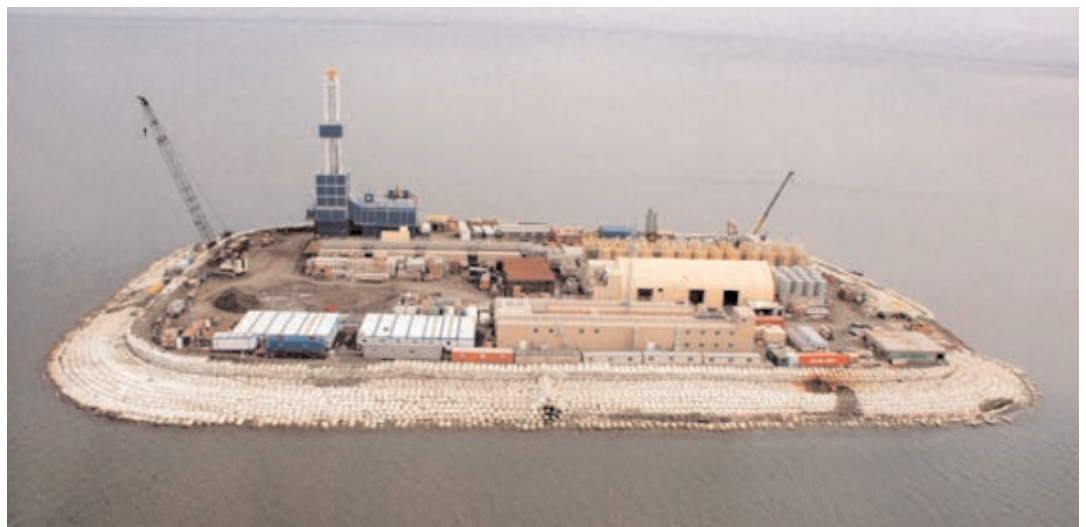
Oooguruk Island, North Slope, Bering Sea

We anticipate spending by the mining industry—on exploration, development, and upgrading existing mines—to be up 15% this year. With the completion of the Kensington and Rock Creek mines, no new large-scale mines will be in the development phase this year. But the high prices for both base and precious metals