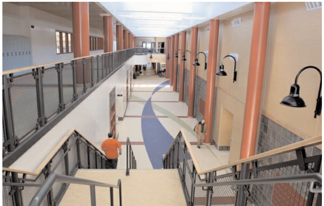
Nicholas J. Begich Middle School, Anchorage