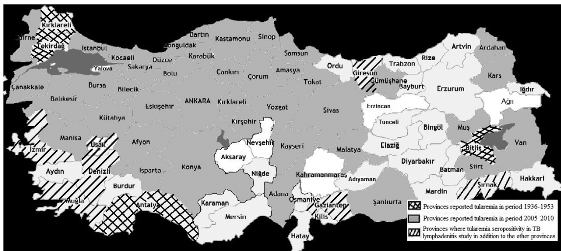
FIG. 1. Distribution of tularemia in the cities of Turkey (72)

Tularemia in Turkey was first reported in soldiers living in the region very close to the Kaynarca stream in Thrace in 1936. The majority of these cases were soldiers who had a history of bathing in the Kaynarca stream and were admitted to the Lüleburgaz Military Hospital. Another small group included the villagers living in the same region and using the same water source (7, 29). A second tularemia outbreak was occurred in Lüleburgaz nine years later (31). These outbreaks affected 168 people in total (26). Additionally, some cases were reported in several places in Turkey (some parts of eastern Anatolia, Tatvan, and Konya). Six patients were affected in the Tatvan-Reşadiye outbreak (30).