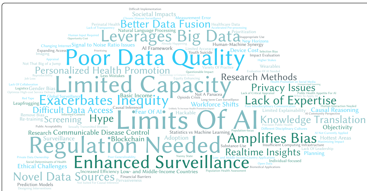
Fig. 1 A word cloud of the study codes, excluding the most general root-codes. The size of each code reflects the number of times that it was applied.

been very data-driven, but that AI could expand these activities even further.