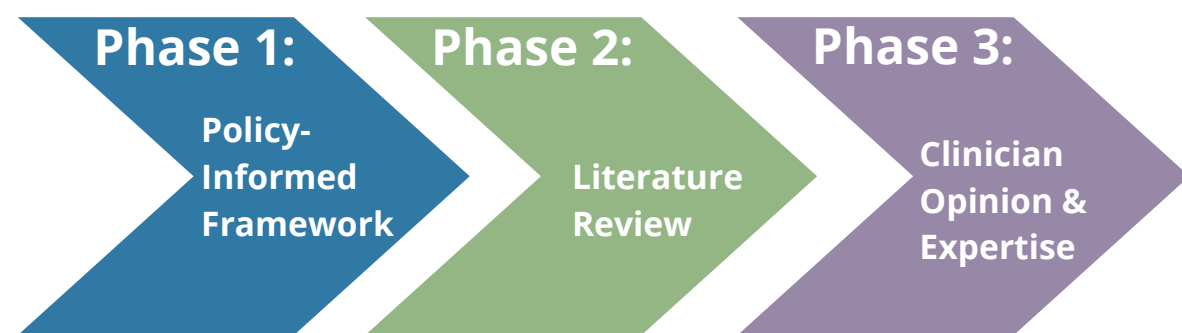
Figure 1: Collaborative-Action Research Approach