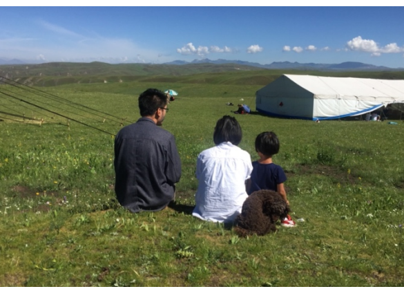
My fieldwork in Tibet, 2017