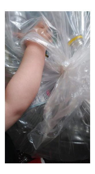
Figure 4.1. Freeing the bottles.

A child's tiny finger pokes a hole in a large clear plastic bag (see Figure 4.1) stuffed with dozens of plastic water bottles. Pulling at the bag, she makes a hole just large enough to push her hand through the opening. Her hand movements are slowed down as she pushes down into the crowded space. With some twisting and turning of the wrist she manages to grab the first bottle and tries to pull it out. Her pulling movements are met with resistance as the remaining bottles surround her hand and cause her to lose her grip. The bottle is wedged—stuck in the bottle heap.