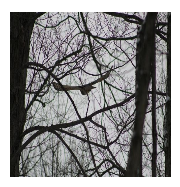
Figure 2.6 Owl in flight.

With snack done and everything cleaned up, we continue the trek excited to locate the nest and owl that the educator described. Three new markers are added to our pathway as we go deeper and deeper into the forest: stick bridge, tipping tree, and owl dinner table (two large logs lying parallel to each other and multiple pellets plopped in the middle). Looking downward and forward have led us closer and closer to the owls, but by looking up we find the nest. Is it the owl nest? One of the children describes the nest as the "mommy owl house." When the educator asks the group where the mom is, several children stare up at the nest or shrug their shoulders, but one child offers that the owl (mom) is "feeding her kids." Today the nest seems empty, but the nest tells us that the unseen owl is definitely present.