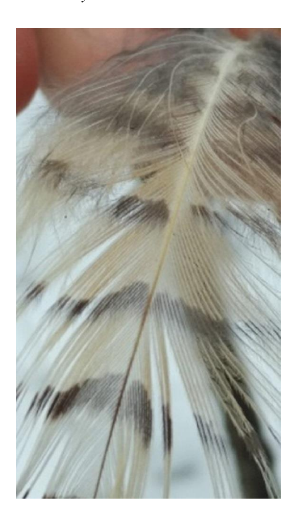
Figure 2.2 Owl feather.

While our intention is to go into the forest to look for the wind, something unexpected happens. As the children, educator, and I stand motionless, the educator notices a feather stuck on a twig flapping in the wind (see Figure 2.1). She points out the feather, telling the group that it might be an owl feather. As we all move in closer to get a better look at the feather (see Figure 2.2), two of the children look back and forth between the feather and the sky.