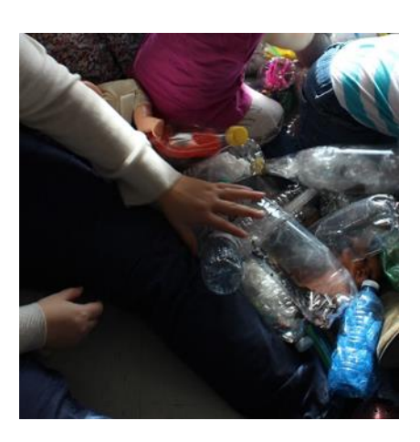
Figure 4.3. Bottles spilling over the edges.

of the bottles over the educators' legs (see Figure 4.3). With the first few children wriggling and burying themselves in the mound of bottles, other children are drawn closer and then jump in to join the mix. At first there is a great deal of noise and movement amongst children and bottles alike, but as the bottles spill out over the edges, the children respond by bringing them back in.