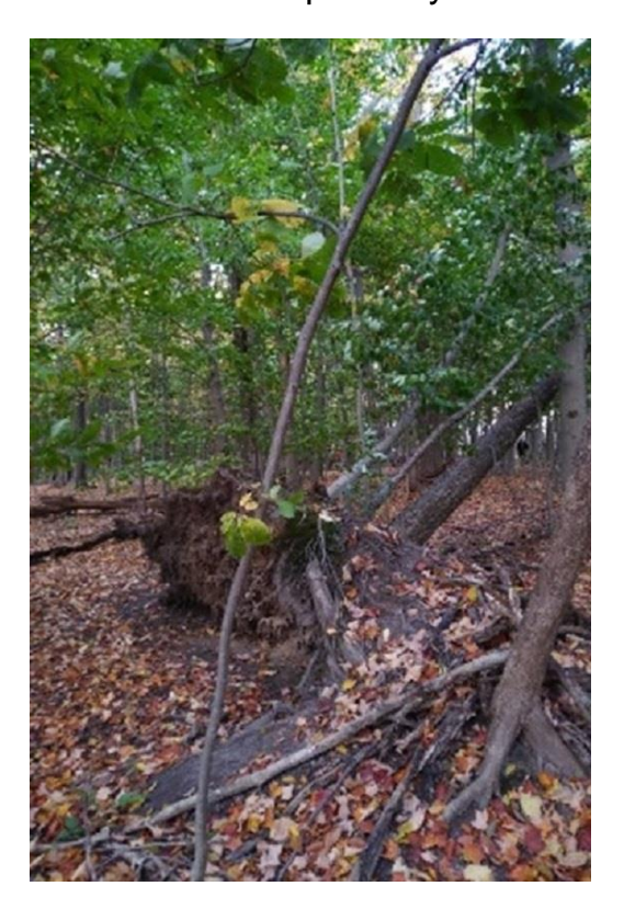
Figure 2.4 Climbing tree.

Our wanderings into the forest have begun to gather us in very particular spots: the climbing tree, stick houses, the fallen tree, and the fishpond. Although we sometimes pause in these places, they have become something of a pathway, each adding a new marker to the path that leads us deeper and deeper into the forest.