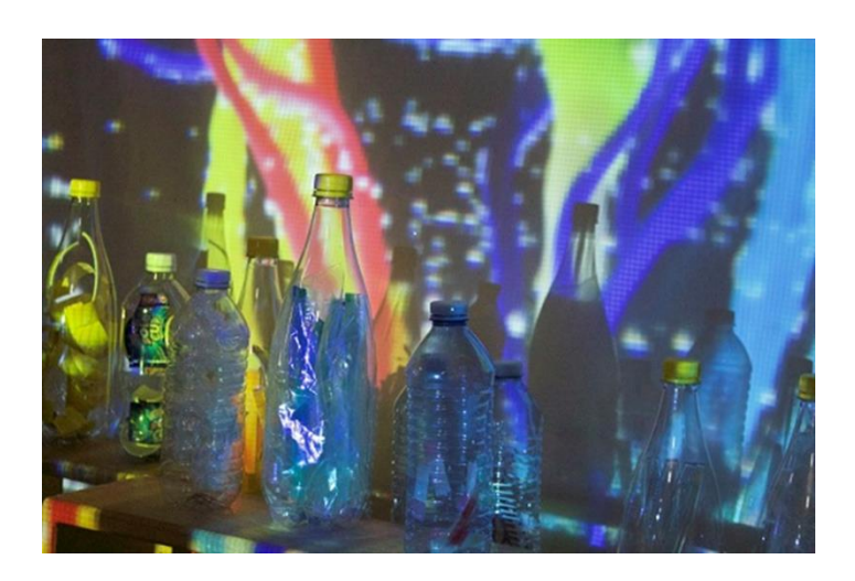
Figure 3.3 The plastic classroom.

permanence, compels a (re)think of human-plastic entanglements. As part of this (re)thinking, we wonder how keeping plastics in sight in our classroom reconfigures young children's relationships with plastic waste and how learning might be affected in the process of being and becoming with plastics. The following excerpt from the documentation for the first day of the plastic inquiry demonstrates the co-constitutive relations of children and plastics.