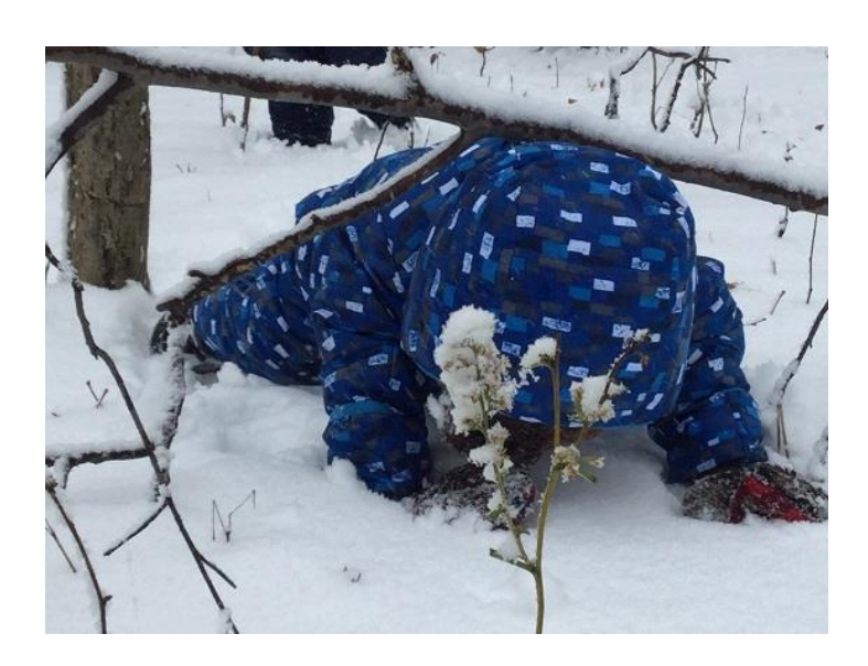
Figure 2.11 Following the critter tracks.

We just wait and wait and wait. He talks about the tree being the bunny's home and the hollowed-out space its door. Maybe he's not home right now or maybe he's sleeping a long time. As always, we run out of time, and as in many cases, we never ever see any critters. Before we join the rest of the children, I ask him how he knows that there is a bunny. He responds with a simple gesture toward the tracks and states, "See, bunny." He knows that tracks lead us.