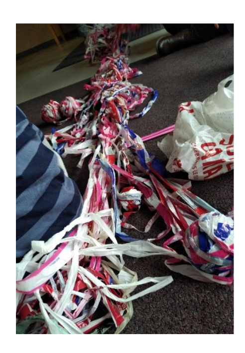
Figures 4.5. Unravelling the tangles.

At first the children try to pull the yarn ball back toward their bodies by pulling on the loose thread, but with each pull the ball rolls farther and farther away. One of the children tells another, "I get it back." With the much smaller yarn ball brought back, he turns to retrieve the loose thread and drops the now tangled mess onto the other child's waiting foot. "Get it off." "It stuck." With every kick the second child makes, the more entangled the foot and yarn become (see Figure 4.5). "Help, I stuck."