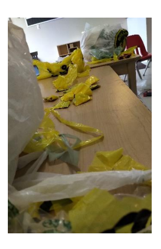
Figure 4.4. Becoming yarn.

From the heaping pile of plastic bags, the children, educators, and researchers pull out one bag at a time and then one by one flatten and smooth out each individual crumpled-up plastic bag (see Figure 4.4). The plastic bags make their presence known as they interact with bodies to create a static pulling and bonding, bag to body and body to bag. Tiny pieces of plastic break away during the smoothing process and stubbornly stick to the children's tiny fingers, refusing to let go even as the children vigorously shake their hands. One child says, "Look... it stay stuck on me," while another shakes their hand and tells the educator, "Can't get it off." The educator responds by showing them that the plastic sticks to her as well. One of the children reaches her plastic-covered finger outward, gesturing toward the educator. With slow and gentle movements, both covered fingertips touch then pull apart, but the plastic scraps remain stuck. As the child says, "Look, it stay!" she quickly moves her finger around to show the others, but the plastic piece responds to the movement of the air and falls to the ground.