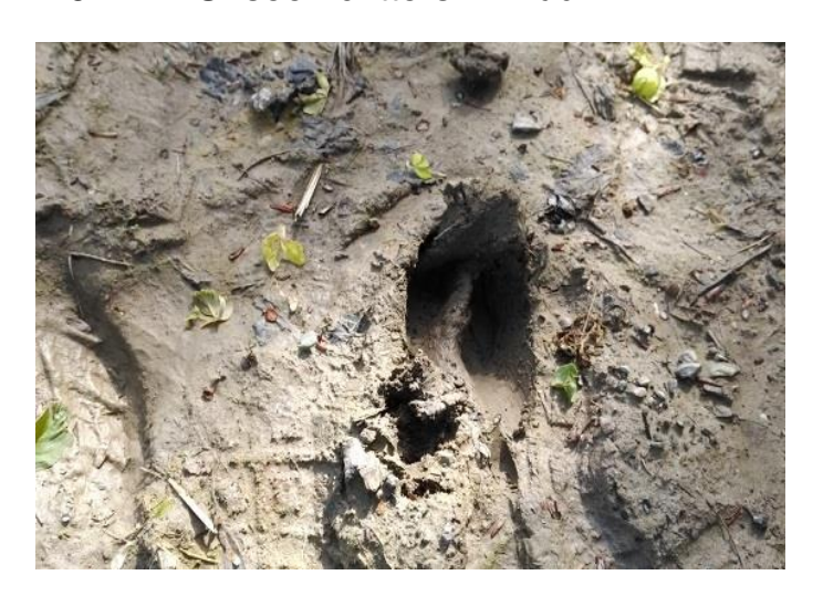
Figure 2.8 Deer track in mud.