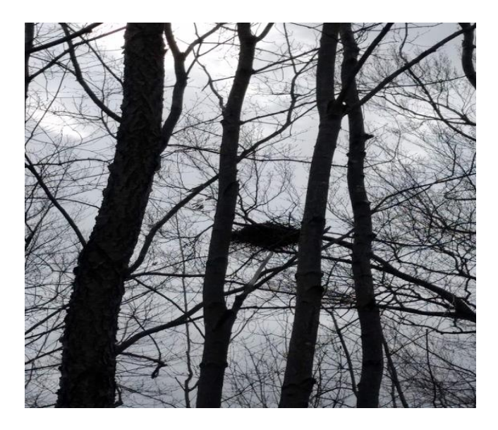
Figure 2.5 Large bird nest.

Through the shadows, sounds, and sightings, the children, educator, and I convince ourselves that an owl family has come to roost in the forest. The educator has also shared images of a large nest and large bird soaring through the forest with the children (see Figures 2.5 and 2.6). While we cannot be sure the one image is of an owl, the children have named her Hootie and told us she is the mother.