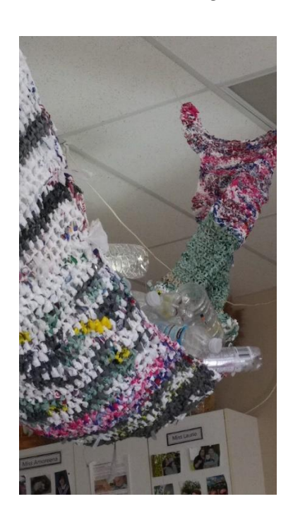
Figure 4.2. Crocheted whale.

easy as the belly can only stretch so far to contain the excess plastic (see Figure 4.2). As one bottle is placed precariously on top of the heap another falls to the ground unable to remain contained in the whale's belly. The belly shakes as it takes and accepts the bottles. The balancing act lasts, for now.