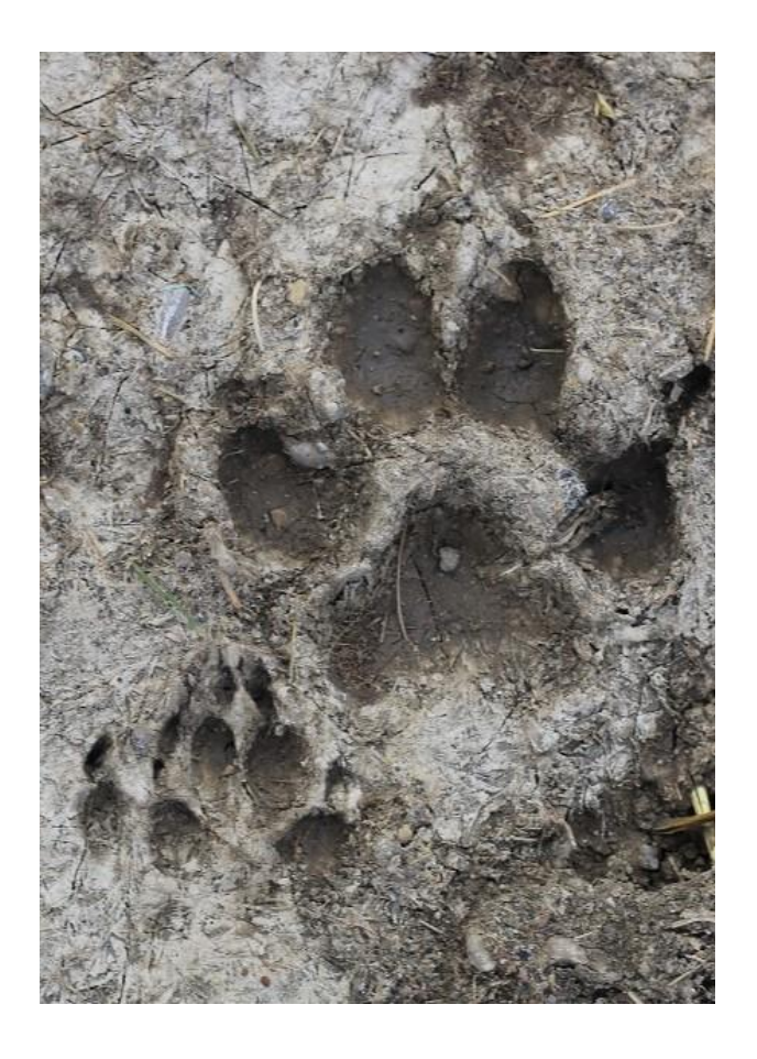
Figure 2.9 Coyote track in mud.