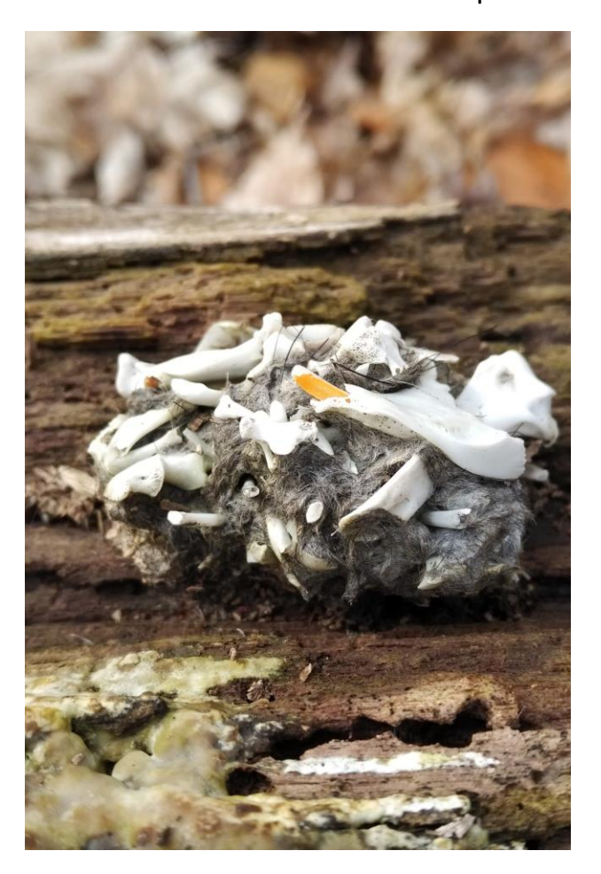
Figure 2.3 Owl pellet.

As the children, educator, and I venture back into the forest, we continue to think with the lone owl feather left tangled on the branch. As a group, we decide to find the owl. While the educator and I look upwards to see if an owl might be perched in a tree, we notice that the children are looking downward. One child is kicking at the leaves, another uses a stick to push the forest debris across our path into the forest, and the other three are staring at the ground. When the educator and I ask what they are all doing, two of them yell, "A feather! Looking for a feather!" Although some of the children have already said owls live in "tree nests," the educator and I are curious and ask one of the children why they are looking at the ground. The children seem to connect looking for a feather as synonymous with looking for an owl.