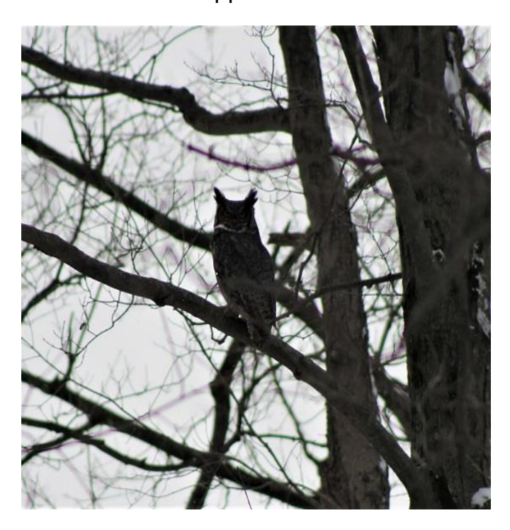
Figure 2.7 Watchful owl.

The owl emerges from the shadows (see Figure 2.7). "See! See it! It's the owl!" The owl perches high up on the tree quietly watching us as we (adults included) jump and point with uncontainable excitement. One of the children is quick to name her Hootie. "Hootie," he tells us, "is the mom."