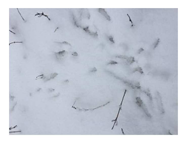
Figure 2.10 Critter track in snow.

During a winter walk through the forest, we find many tracks in the snow (see Figure 2.10). The freshly fallen snow has made visible the critter tracks. The tracks, in turn, make the unseen critter movements visible. It is the focused tracking of one particular set of tracks a child follows that leads to an encounter between the child and an unseen bunny. This encounter is a story of care and companionship, of entanglement rather than separation.