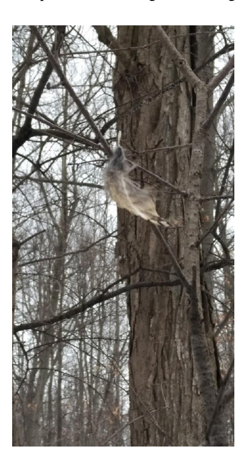
Figure 2.1 Stuck feather.

We spend much time in the forest seeing what relations emerge between children and those who live in the forest space. Although we have yet to see any critters in the forest, we spend time noticing their tracings, such as footprints and poop.