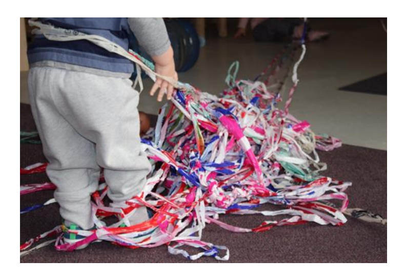
Figure 3.1 Tangled with plastics.

Hooks, plastic yarn, and fingers act and react to each other as delicate loops begin to transform the yarn balls. In keeping with our understanding of common worlding, our encounters with plastic yarn are "mutually transformative" (Taylor & Giugni, 2012, p. 112). Common world waste pedagogies provide space to think. Perhaps crocheting offers a metaphor for the process of being and becoming in relation with the more-than-human other. Each tug, knot, loop, and even tangle reminds us that transformation is coconstitutive.