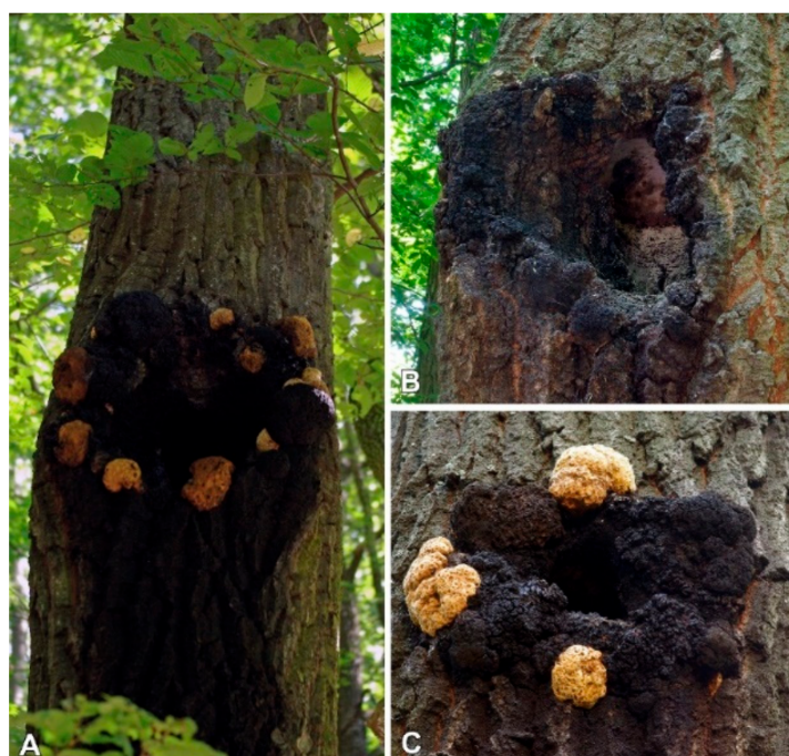
Figure 1. Basidiocarp and the imperfect stage (sterile conk) of Inonotus nidus-pici on living Quercus cerris in Hungary. (A) Young and old sterile conks of the studied specimen (PV1043); (B) old sterile conks and sporulating basidiocarp (Börzsöny Mts, 19. Jun 2021; (C) young and old sterile conks (Visegrád Mts, 1 October 2011).

According to the literature, I. nidus-pici ( Hymenochaetaceae , Basidiomycota ) is considered to be a mainly Central-Eastern European species, but has also been identified in Spain and Iran [23–25]. Given the lack of any information on the chemical profile of I. nidus-pici , we