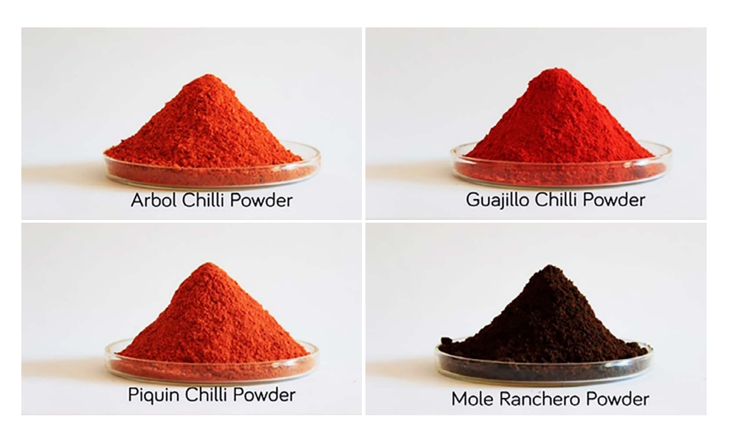
Figure 2. Angle of repose evaluated from traditional mexican chilli powders ( Capsicum annuum L.)

1.4 indicate a behavior fairly to free-flowing powders. "Arbol", "Guajillo", "Piquin" and "Mole ranchero" showed a cohesive behavior fairly to free flow with significant difference between Carr index and Hausner ratio values. "Mole ranchero" is a very cohesive powder due to its higher moisture content of 14 gH<sub>2</sub>O/100g d.s. respect to "Arbol", "Guajillo" and "Piquin" chili at moisture contents of 7.92, 9.58 and 6.59g H<sub>2</sub>O/100g d.s. respectively.