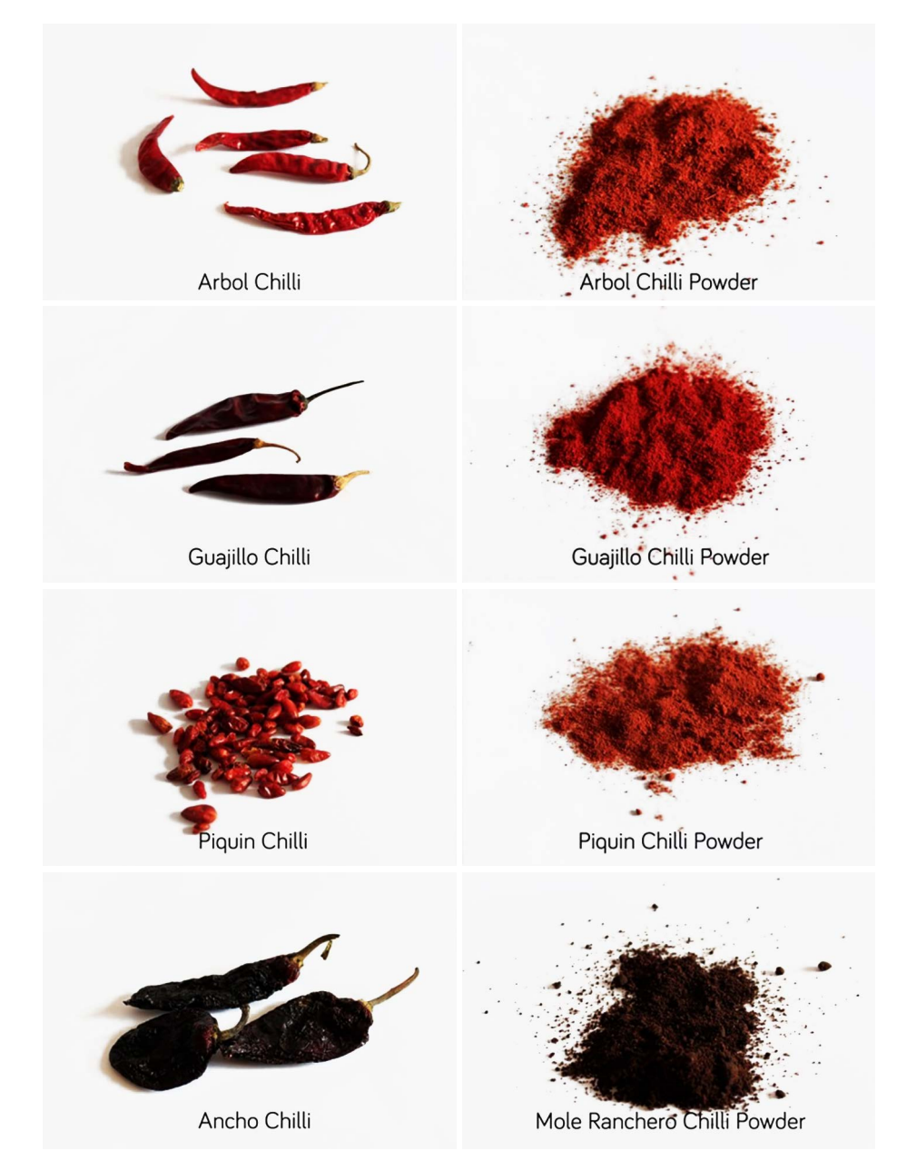
Figure 1. Traditional mexican chili powders (Capsicum annuum L.)

Samples : Four samples of traditional Mexican chili powders: "Arbol", "Guajillo", "Piquin" and "Mole ranchero" (Ancho chili), were purchased in a local market from Toluca, State of Mexico, Mexico. Capsicum oleoresin standard was provided by Sensient Colors Company, S.A. de C.V. (Lerma, State of Mexico, Mexico). All reagents used in the study were purchased from Sigma-Aldrich, S.A. de C.V. (Toluca, State of Mexico, Mexico).