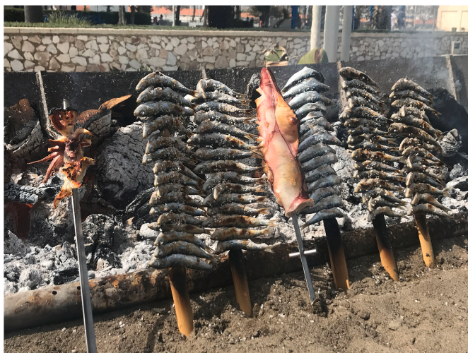
Fig. 3. Sardine (and cephalopods) skewers ( espetos de sardinas y calamares ) are one of the most demanded culinary specialties in beach bars ( chiringuitos ) and restaurants along the coast of Málaga (Southern Spain). They are a sign of cultural identity and have been declared by UNESCO as Intangible Cultural Heritage of Humanity in 2020.

was highlighted (Villegas, 2014). This bet had already been included in the manifesto of the previous Spanish movement, called New Basque Cuisine, read by Pedro Subijana in 1976 and among whose demands was the search for new culinary ingredients such as seaweeds (García, 2017).