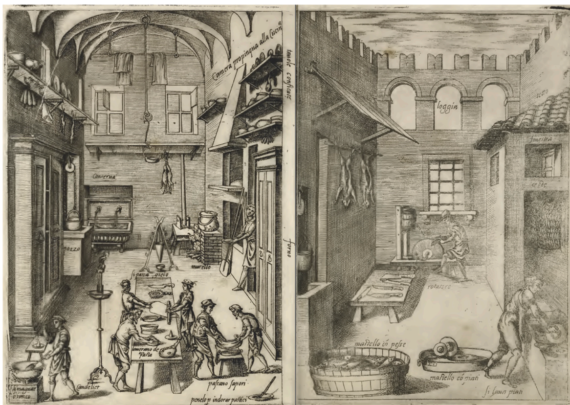
Fig. 2. An example of the beautiful illustrations from Scappi's cookbook Opera (1570).