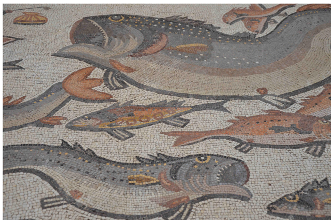
Fig. 1. Detail of a seascape mosaic with marine animals (tuna, sea bream, swordfish, scallops, sea snails) believed to belong to a large and well-appointed Roman house (about 300 CE).