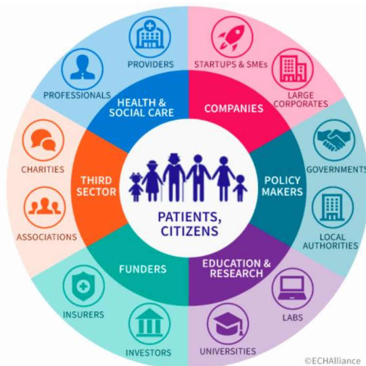
Figure 1. Example of a Health and Wellbeing Eco-system