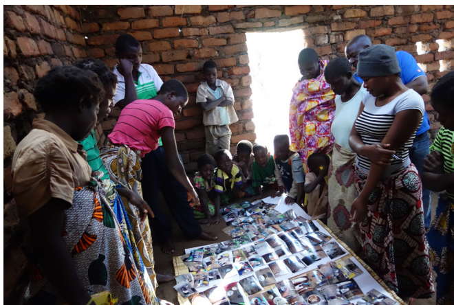
Figure 3 Photovoice focus group discussion in progress in Village 2.

health impacts of the intervention cookstoves; and how any saved time from faster cooking was used.