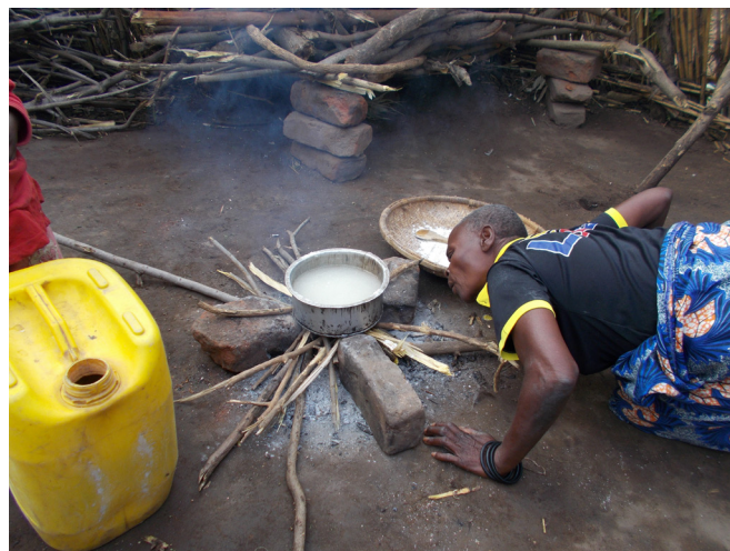
Figure 4 Image of older woman blowing on fire to light it.

Those ones [participant points to a photo of an open fire] need us to blow air into, while the other ones blow themselves... we will just be taking our firewood and see that the