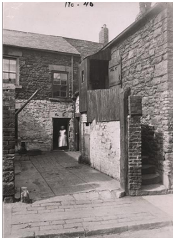
Fig. 2: Rear of 5 Buckingham Street, adjacent to the Dockertys' house

were recorded with the occupation of 'taylor' (sic). 56 It is perhaps significant that Mr Dockerty was a tailor when the couple met, and is described as such in the 1851 census and in his evidence to the coroner and the judge in 1863. 57 Evidently he did not find (or possibly seek) employment in any of the growth areas of industry: coal, iron and steel; shipbuilding and engineering; quarrying; glass making; or the chemical industry associated with the Tyne. As his eldest sons also became tailors, the family had no reason to live near the Quayside.