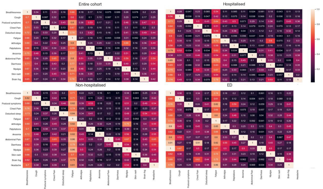
Figure 3 Co-occurrence of symptoms at first assessment of 1325 individuals referred to the post-COVID-19 assessment clinic. ED, emergency department.

in 5.8%, troponin T in 13.4%, creatine kinase in 16.9%, alanine transaminase in 18.0% and D-dimer in 18.9%. Abnormal blood investigations were more common in PH than in NH individuals (D-dimer: 28.3% vs 10.3%; troponin T: 27.0% vs 4.7%; NT-proBNP: 17.0% vs 0.0%; and eosinophil count: 6.8% vs 2.5%) (online supplemental table 2).