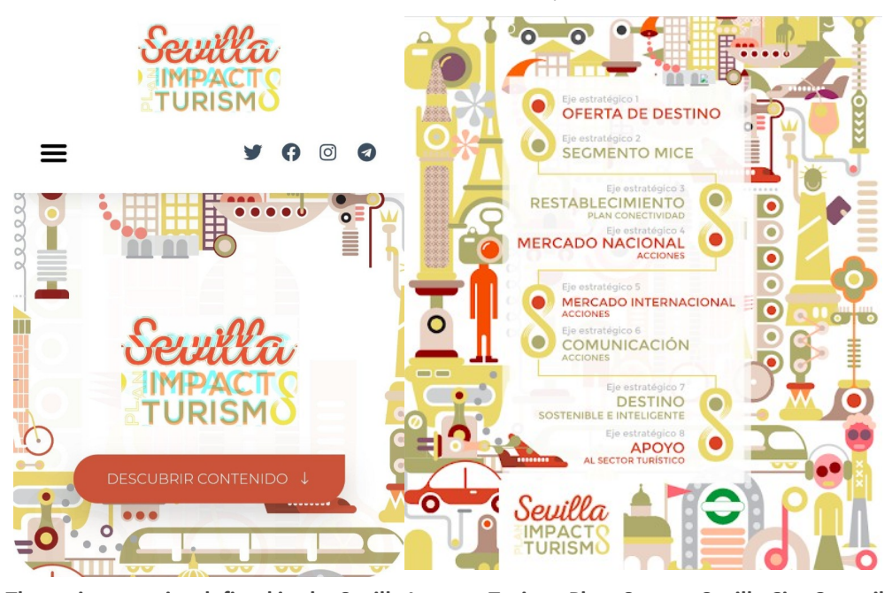
Figure 5. The mainstrategies defined in the Sevilla ImpactoTurismoPlan.

result of this situation 23,67% of touristic apartments in Seville and 20% in Malaga haven't received tourists, or have been removed from rental portals like Airbnb and Vrbo. According to the real estate portal Idealista, long term rental offers in July increased 86,7% in Seville and 109,3% in Malaga, compared to July 2019 (Pereira, 2020). This data can be read as a shift from short term to seasonal and long-term rents that in Spanish law are forced to last a minimum of five years, relaxing and balancing the housing rental market. As a consequence, it becomes evident the unsustainability of a monothematic touristic model which entails serious socio-economical risks for a country.