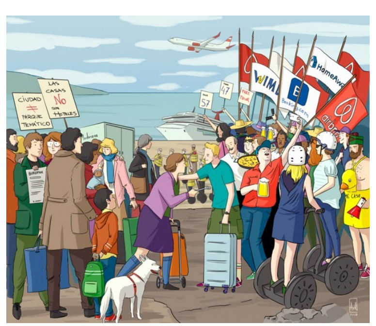
Figure 3. Left: "Surviving at the city centre" announcing the 3rd Photography Competition of the Residents Association of the Historic Centre of Malaga. Right: "La Rendición" by Alejandro Villén. Based on Velazquez's "The surrender of Breda".

Real income change across percentiles of the income distribution: