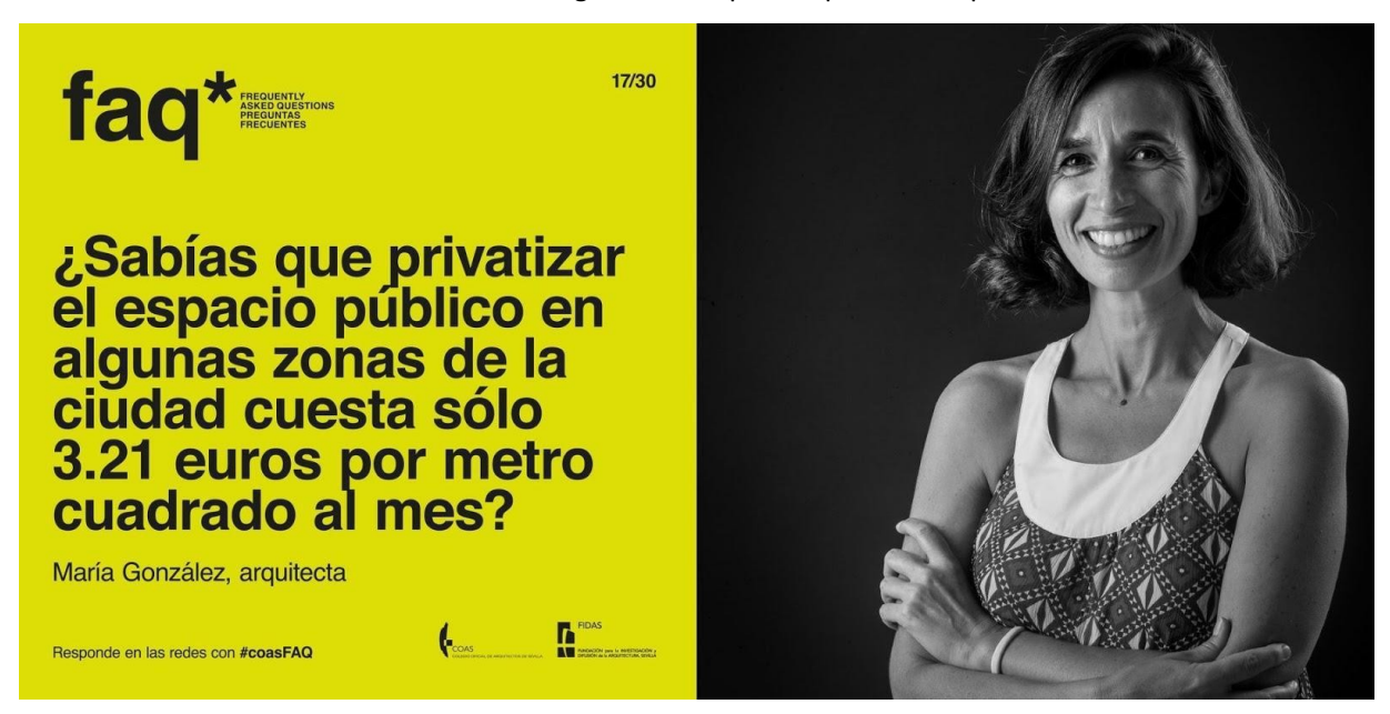
Figure 1. Messages from renowned architects published in Seville during 2019 Architecture week. The one here presented talks about the cost for bars and restaurants to occupy public space with terraces.

2001 and 2007 the noise levels on some of the main areas of the city centre. As a result, thirteen streets were assessed as Saturated Acoustic Zones (ZAS). Unexpectedly, both studies had no consequence in limiting the leisure activities and environmental noises in these areas. Faced with the passivity of the city council, the noise levels of 2015 were four times higher than 2007's ones. Eventually, under the regional legislation against the noise pollution in Andalusia, the municipality approved in 2018 the declaration of ZAS in the city centre, but it is rarely applied because of the pressure of the tourism industry (Marin, 2019). As a result, despite evidence and correlations, there are no direct effects of ZAS regulations on timetables of leisure activities and on the regulations of public spaces' occupation.