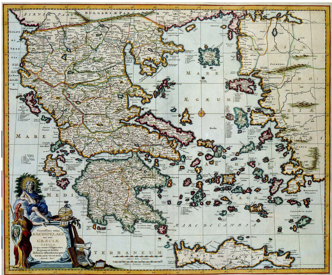
Figure 1. A map of the Aegean, by Nicolaum Visscher (1649–1702), published around 1681, illustrating a complex island region in which it is challenging to decide on archipelago or meta-archipelago membership from a biological perspective.

meaning developed presumably since the Aegean Sea is replete with large numbers of islands. We use the term today for chains, clusters, or collections of islands. Yet in complex island regions such as the Caribbean or South-East Asia (Sunda Islands, New Guinea, Philippines) and parts of the South Pacific/Polynesia, it is often debatable where one archipelago ends and another begins (Benítez Rojo and Maraniss 1985, above). This matters in island biogeography as many of our analyses are based on data sets structured into archipelagos (e.g., Bunnefeld and Phillimore 2012). The rationale for this is that islands configured in isolated geographical groups exchange information (i.e., there are movements and exchanges of pollen, spores, propagules, individuals, semi-nomadic flocks, and perhaps even nutrients and energy) and they do so to a significantly greater degree than they do with any other more distant land-masses.