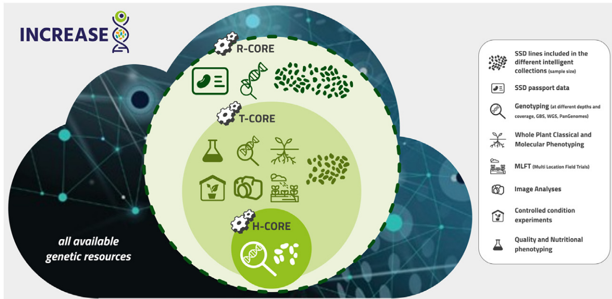
Figure 2. Schematic summary of INCREASE Intelligent Collections (ICs): Reference-CORE (R-CORE), Training-CORE (T-CORE) and Hyper-CORE (H-CORE) developed in INCREASE and activities that will be carried out on the different panels. Starting from all the available genetic resources for each of the four INCREASE legume species, R-CORE will be constituted of thousands of single-seed descent (SSD) lines, representative of the genetic resources of the species, with as complete and informative as possible passport data, and R-CORE will undergo low-coverage genotyping; T-CORE will be constituted of a subset of R-CORE (few hundreds of SSD lines) which will be involved in several phenotypic (including transcriptomic and metabolomic) and genomic characterizations (whole genome sequencing [WGS]); H-CORE, the smallest sample (about 40–50 SSD lines, based on an evolutionary transect) will be in-depth genotyped and phenotyped. All the genotypic data and information and related genomic predictions coming from the characterization of the ICs and of sub-cores of nested core collections will be the link between phenotypically evaluated and non-evaluated accessions from the universe of all available genetic resources (as far as genotyping data are available).

lines, domesticated lines not adapted to European environments and CWRs, which will be used mostly for controlled condition experiments. Thus, T-CORE phenotyping will be based on different sub-samples based on the type of experiment and the level of complexity of phenotyping (e.g., intercropping experiment using common bean and maize [ Zea mays ], drought-controlled condition experiment for chickpea and common bean, etc.);