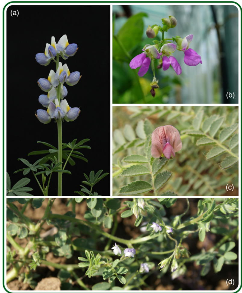
Figure 1. Flowers of the four INCREASE legume species. (a) Lupin ( Lupinus mutabilis Sweet). (b) Common bean ( Phaseolus vulgaris L.). (c) Chickpea ( Cicer arietinum L.). (d) Lentil ( Lens culinaris Medik.).

heterogeneous, which impedes the projection of the phenotypic information to the genotype and vice versa ; moreover, if available, single-nucleotide polymorphism data are mapped to a single reference genome, which exclude variants present only in a subset of accessions, without the possibility to access structural variations and to obtain a complete picture of the functional genetic variation (Richard et al., 2021);