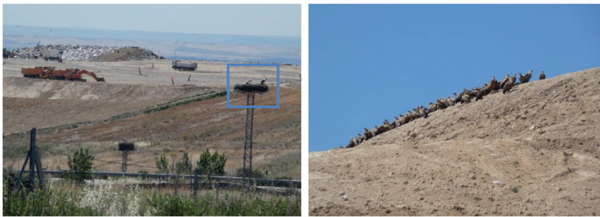
Fig. 2s. Landfill in northern Madrid intensively visited by white storks, black kites, griffon vultures (right panel) and black vultures, what reflects scarcity of carcasses and livestock in the countryside. White storks breed inside the landfill (left panel) (author: Alejandro Martínez–Abraín).

Fig. 2s. Vertedero al norte de Madrid visitado frecuentemente por cigüeñas blancas, milanos negros, buitres leonados (imagen derecha) y buitres negros, lo que refleja la escasez de cadáveres y de ganado en el campo. Las cigüeñas blancas se reproducen dentro del vertedero (imagen izquierda) (autor: Alejandro Martínez–Abraín).