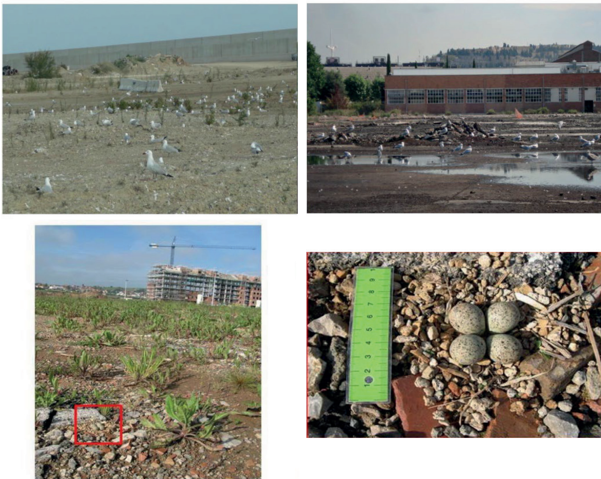
Fig. 1s. Upper panel: Audouin's gull ( Ichthyaetus audouinii ) breeding colonies at a harbour dock under construction in Castellón (E Spain) (left), and in a coastal industrial area in Barcelona city (Zona Franca) (right). In both cases gulls chose a fenced open area close to a fishing port. Lower panel: location of a Little ringed plover ( Charadrius dubius ) nest in an area under urban development (left) and close up of the nest (right). These areas are beneficial for plovers because they have poor vegetation cover.

Fig. 1s. Imágenes superiores: colonias reproductoras de gaviota de Audouin (Ichthyaetus audouinii) en un muelle portuario en construcción en Castellón (España oriental) (izquierda) y en una zona industrial costera de la ciudad de Barcelona (Zona Franca) (derecha). En ambos casos, las gaviotas eligieron una zona despejada vallada cerca de un puerto pesquero. Imágenes inferiores: ubicación de un nido de chorlitejo chico (Charadrius dubius) en una zona en desarrollo urbano (izquierda) y primer plano del nido (derecha). Estas zonas son beneficiosas para los chorlitejos porque tienen poca cubierta vegetal.