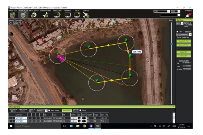
Fig. 3. Mission Planner software

To validate the proposed platforms described in chapter 4, field tests will be realized in the Castelo do Bode reservoir, one of Portugal's main water reserves. Figure 3 shows a sample mission, created using software for ground station control [10], which shall be executed by a robotic prototype developed by the research team from IPT. This is a very simple test and is intended as a proof of concept.