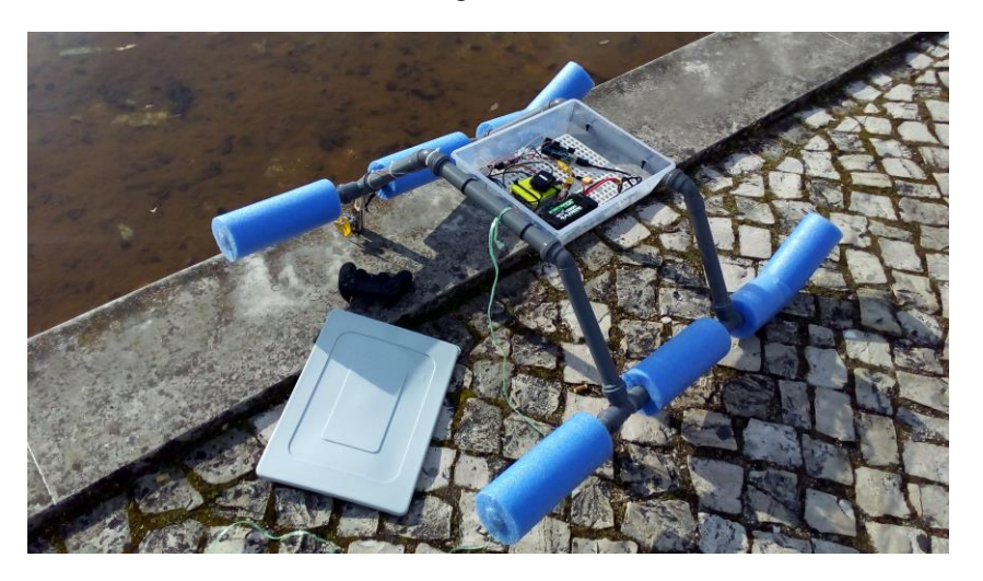
Fig. 4. Working prototype for a low-cost unmanned surface vehicle, developed by the research team from IPT.

navigable space, are desirable features that provide an important layer of intelligence and added mission autonomy. The proposed system has many potential applications and use-cases like surface water monitoring, wastewater management, research and development departments, small companies and individuals, local authorities and administrations, academic research, among others.