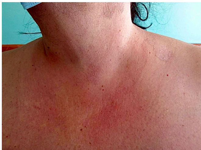
Figure 6 Urticarial rash on the cervical and chest region.

SARS-CoV-2 infection, tested for by a nasopharyngeal swab, was diagnosed. Laboratory tests showed lymphopenia (700/