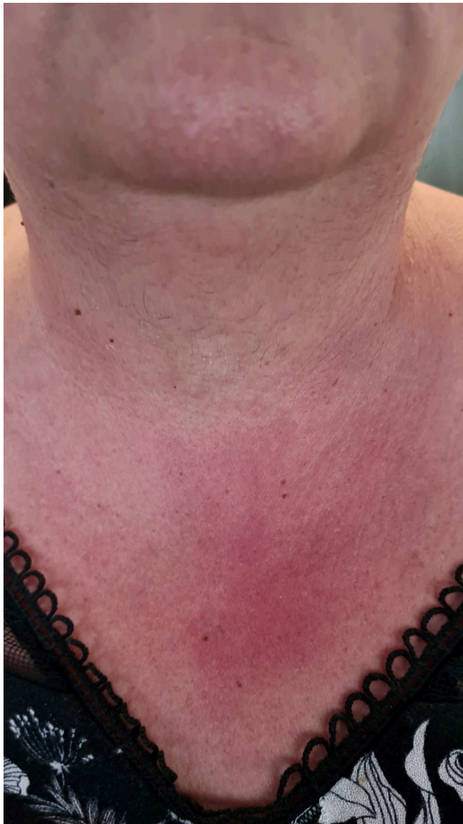
Figure 8 Urticarial rash 1 month after discharge.

professionals. Despite all the information currently released on this virus, much remains unknown about the disease's clinical characteristics, including dermatological manifestations.