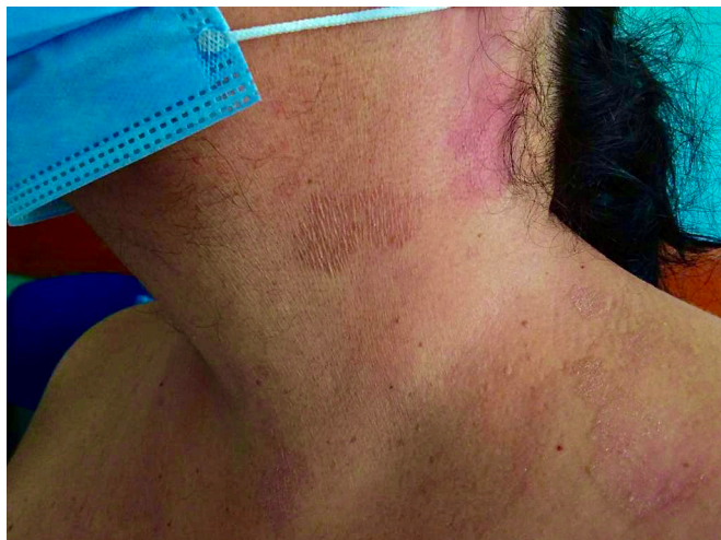
Figure 5 Urticarial rash on the cervical region.

and ionogram were all normal. There were no signs of pneumonia on the chest X-ray.