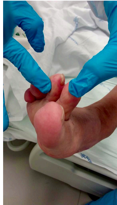
Figure 3 Erythematous–violaceous macules in the interdigital region.