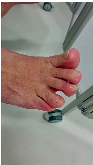
Figure 2 Erythematous–violaceous macules in the interdigital region.

oxygen flow. On the day of discharge, the patient maintained the skin changes despite the resolution of COVID-19 symptoms. In the re-evaluation consultation, 30 days after discharge, complete resolution of the dermatological manifestations was noted.