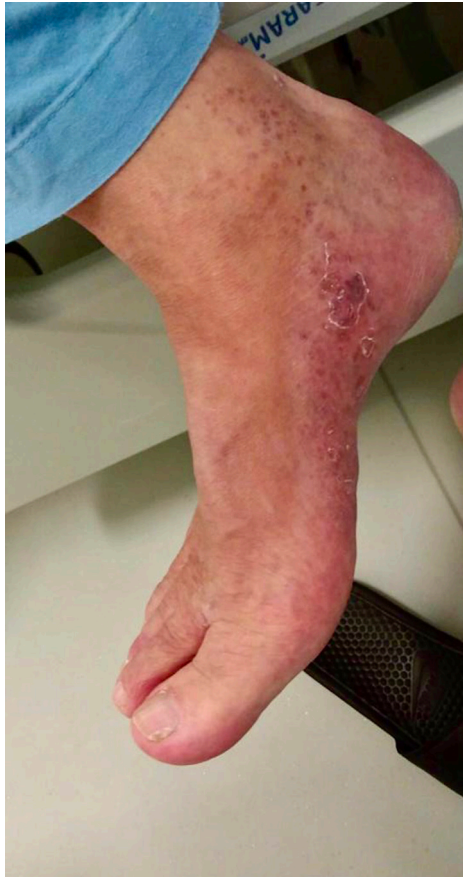
Figure 1 Erythematous–violaceous macules on the inner side of the right foot.

oxygen flow. On the day of discharge, the patient maintained the skin changes despite the resolution of COVID-19 symptoms. In the re-evaluation consultation, 30 days after discharge, complete resolution of the dermatological manifestations was noted.