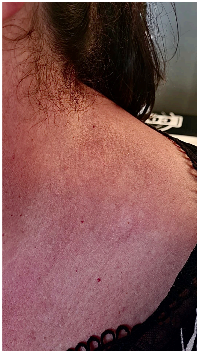
Figure 7 Urticarial rash 1 month after discharge.

\mu\text{L} ), increased D-dimers (500 ng/mL), abnormal liver function (alanine aminotransferase 60.6 U/L, aspartate aminotransferase 115.9 U/L and GGT 108.4 U/L), elevated LDH (316 U/L), CRP (106.21 mg/L) and ferritin (2886 ng/mL). Platelet count, renal function and ionogram were normal. Chest X-ray was negative for pneumonia.