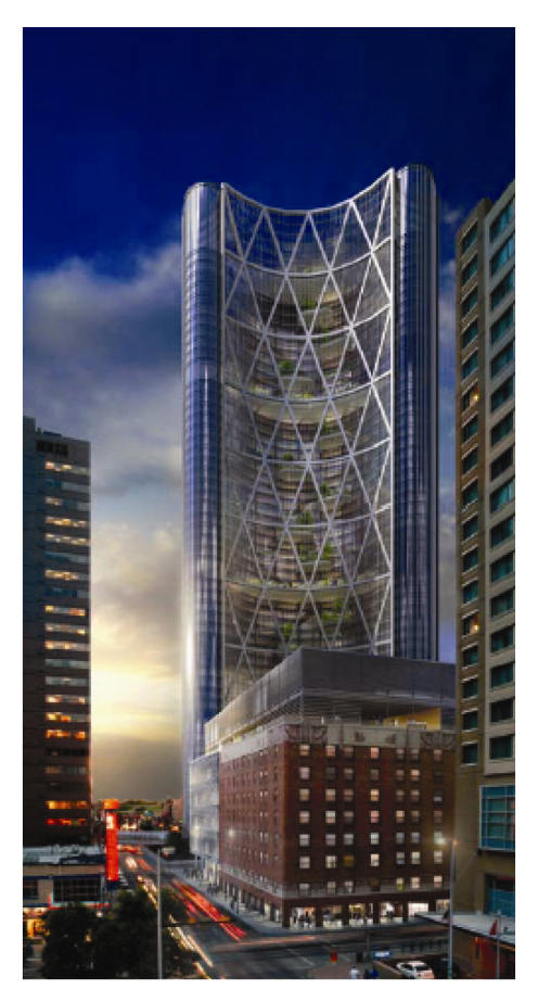
Fig. 2. The "Bow" Diagrid Tower (courtesy of Foster + Partners)

system of core and outriggers, mega-diagonals through the tower interior, a rigid frame perimeter tube of closely spaced columns, and the perimeter trussed tube in a triangular shape diagonal grid, called diagrid, with six-story high diagonals along the curved north and south elevations. The diagrid form was selected partly for architectural expression and aesthetics. It avoids the use of interior concrete shear wall to maximize the open interior space. The placement of the diagrid nodes in a uniform triangular manner every six floors provides for the repetition of the components and connections to minimize the fabrication and erection costs. Compared with a conventional braced core or rigid frame perimeter tube structure, this perimeter diagrid system is claimed to reduce about 20% of the structural steel weight by using structural efficiencies of its curved form.