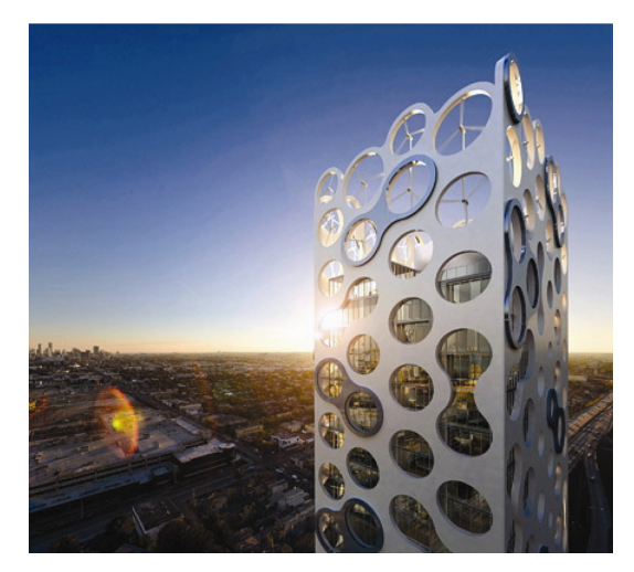
Fig. 1. COR Tower designed for Miami (courtesy of Oppenheim Architect + Design)

more open and entertainment spaces; 4) envelop opacity without extensive solar gain and glare and with insulation from external temperature variations; 5) vegetation: Vegetation improves both structural and urban scales. An example of this approach is the COR Tower (Fig. 1) designed by "Oppenheim Architect + Design" in 2007. This building which is equipped with wind turbines in its facades strives to achieve a balance between transparency and opacity in its skin.